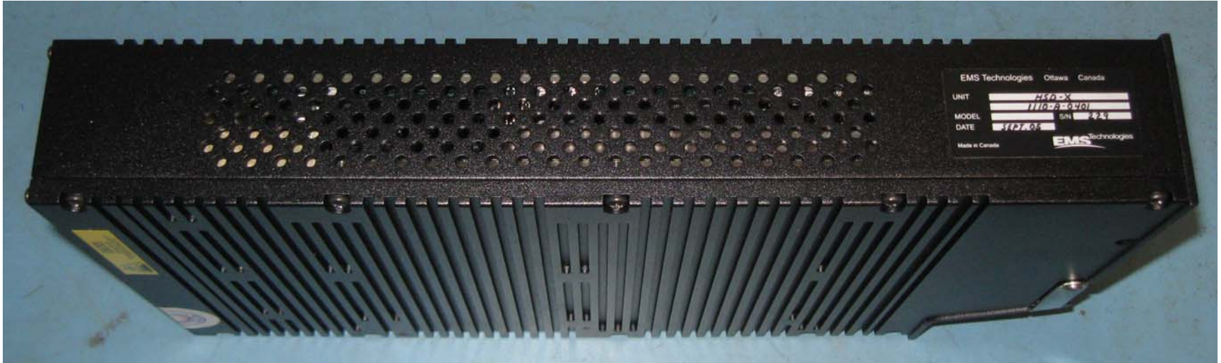
Figure 4: HSD-X Top View

CONFIDENTIAL, UNPUBLISHED PROPERTY OF ONE OR MORE OF THE FOLLOWING - EMS TECHNOLOGIES CANADA, LTD., FORMATION INC., SKY CONNECT LLC (COLLECTIVELY “EMS AVIATION”).