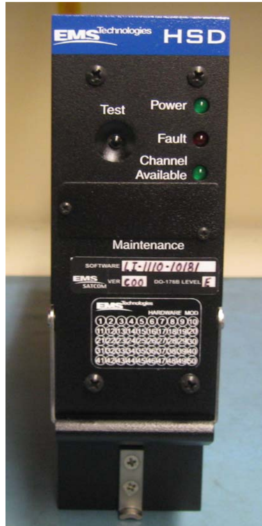
Figure 1: HSD-X Front View

CONFIDENTIAL, UNPUBLISHED PROPERTY OF ONE OR MORE OF THE FOLLOWING - EMS TECHNOLOGIES CANADA, LTD., FORMATION INC., SKY CONNECT LLC (COLLECTIVELY “EMS AVIATION”).