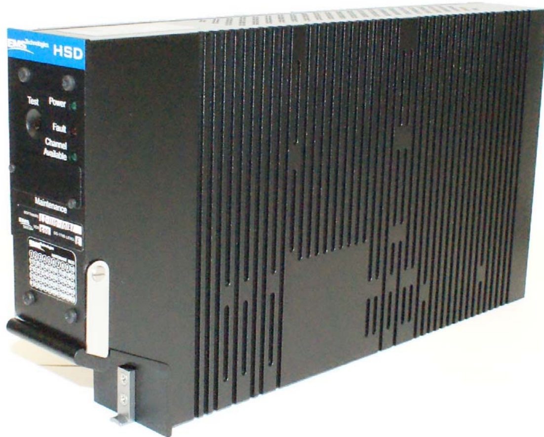
Figure 2: HSD-X Isometric View

CONFIDENTIAL, UNPUBLISHED PROPERTY OF ONE OR MORE OF THE FOLLOWING - EMS TECHNOLOGIES CANADA, LTD., FORMATION INC., SKY CONNECT LLC (COLLECTIVELY “EMS AVIATION”).