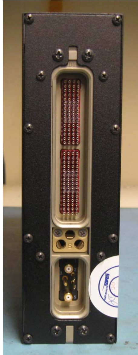
Figure 5: HSD-X Back View

CONFIDENTIAL, UNPUBLISHED PROPERTY OF ONE OR MORE OF THE FOLLOWING - EMS TECHNOLOGIES CANADA, LTD., FORMATION INC., SKY CONNECT LLC (COLLECTIVELY “EMS AVIATION”).