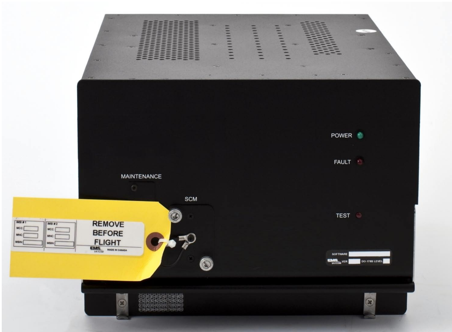
Figure 1: HSD MK2 Front View

CONFIDENTIAL, UNPUBLISHED PROPERTY OF ONE OR MORE OF THE FOLLOWING - EMS TECHNOLOGIES CANADA, LTD., FORMATION INC., SKY CONNECT LLC (COLLECTIVELY “EMS AVIATION”).