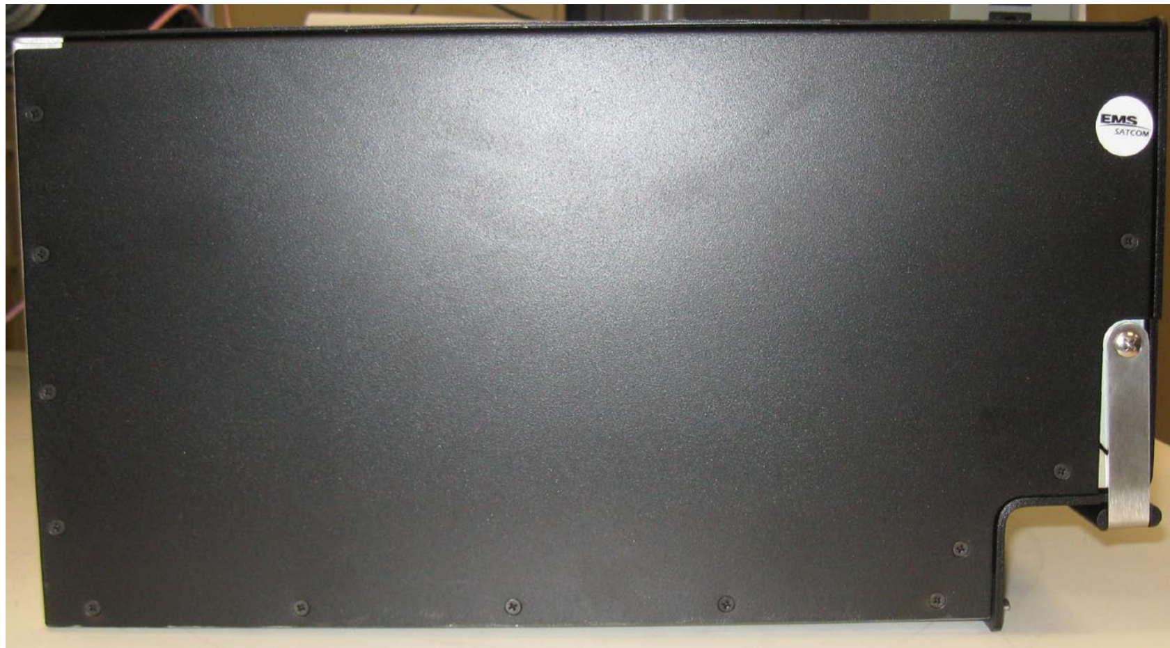
Figure 3: HSD MK2 Side View

CONFIDENTIAL, UNPUBLISHED PROPERTY OF ONE OR MORE OF THE FOLLOWING - EMS TECHNOLOGIES CANADA, LTD., FORMATION INC., SKY CONNECT LLC (COLLECTIVELY "EMS AVIATION").