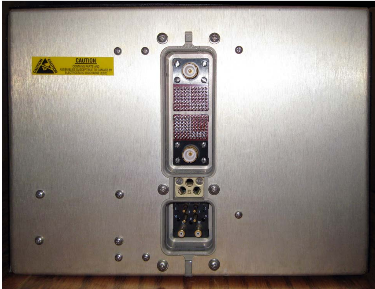
Figure 5: HSD-440 Back View

CONFIDENTIAL, UNPUBLISHED PROPERTY OF EMS AVIATION (EMS TECHNOLOGIES CANADA, LTD., FORMATION INC., SKY CONNECT LLC). USE AND DISTRIBUTION LIMITED SOLELY TO AUTHORIZED PERSONNEL