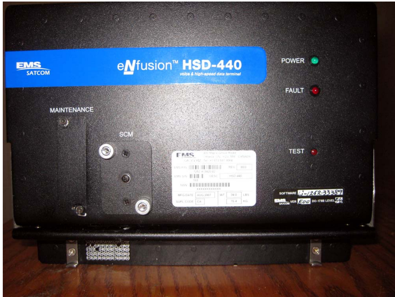
Figure 1: HSD-440 Front View

CONFIDENTIAL, UNPUBLISHED PROPERTY OF EMS AVIATION (EMS TECHNOLOGIES CANADA, LTD., FORMATION INC., SKY CONNECT LLC). USE AND DISTRIBUTION LIMITED SOLELY TO AUTHORIZED PERSONNEL