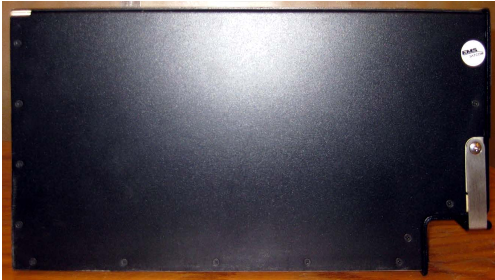
Figure 3: HSD-440 Side View

CONFIDENTIAL, UNPUBLISHED PROPERTY OF EMS AVIATION (EMS TECHNOLOGIES CANADA, LTD., FORMATION INC., SKY CONNECT LLC). USE AND DISTRIBUTION LIMITED SOLELY TO AUTHORIZED PERSONNEL