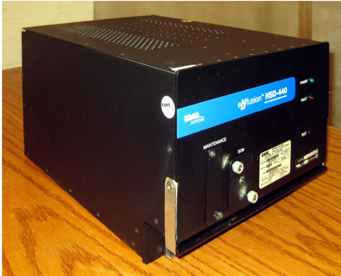
Figure 2: HSD-440 Isometric View

CONFIDENTIAL, UNPUBLISHED PROPERTY OF EMS AVIATION (EMS TECHNOLOGIES CANADA, LTD., FORMATION INC., SKY CONNECT LLC). USE AND DISTRIBUTION LIMITED SOLELY TO AUTHORIZED PERSONNEL