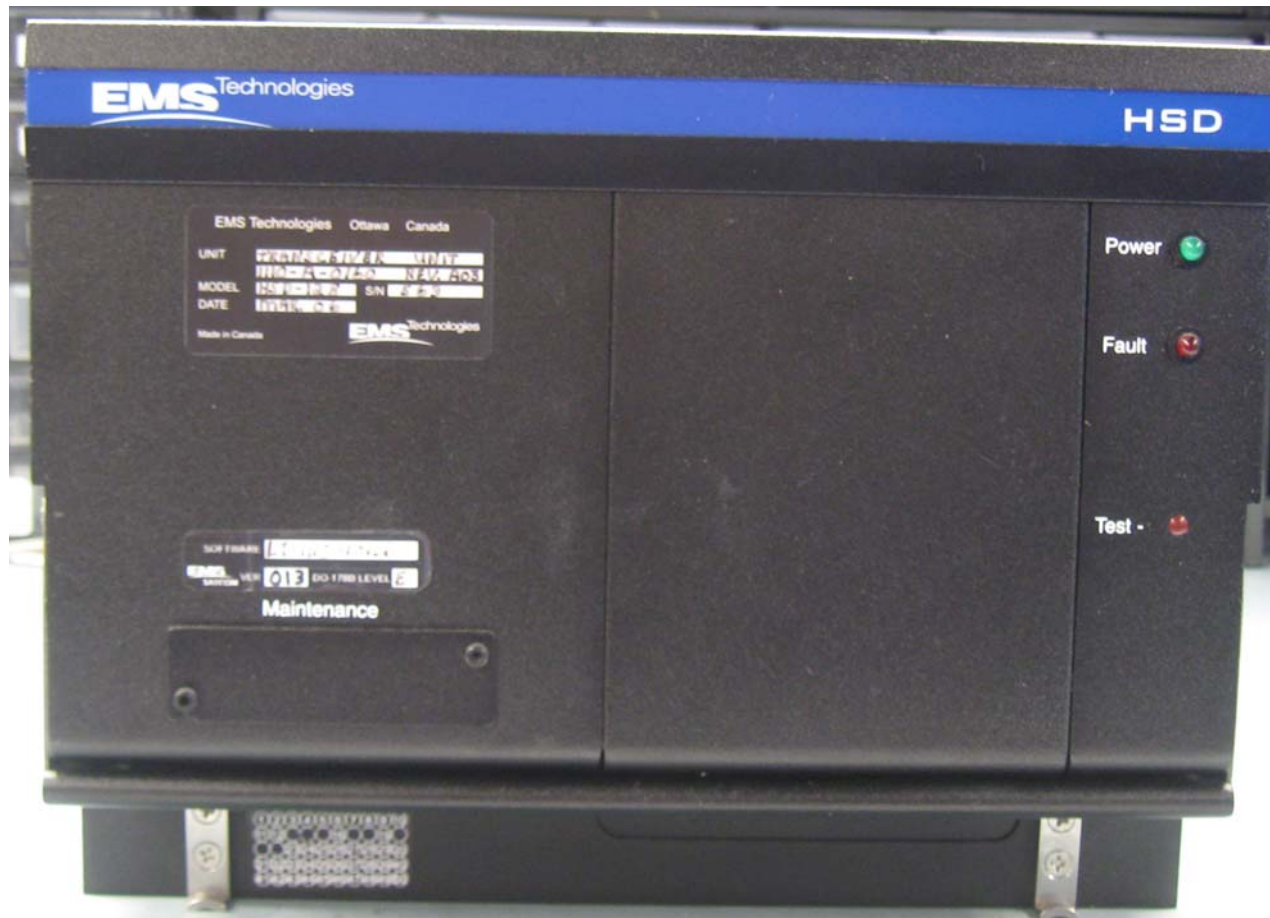
Figure 1: HSD-128 Front View

CONFIDENTIAL, UNPUBLISHED PROPERTY OF ONE OR MORE OF THE FOLLOWING - EMS TECHNOLOGIES CANADA, LTD., FORMATION INC., SKY CONNECT LLC (COLLECTIVELY “EMS AVIATION”).