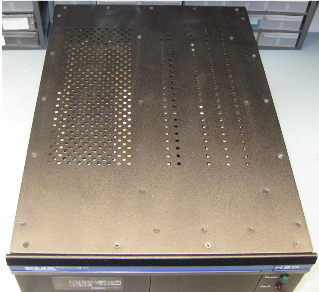
Figure 4: HSD-128 Top View

CONFIDENTIAL, UNPUBLISHED PROPERTY OF ONE OR MORE OF THE FOLLOWING - EMS TECHNOLOGIES CANADA, LTD., FORMATION INC., SKY CONNECT LLC (COLLECTIVELY "EMS AVIATION").