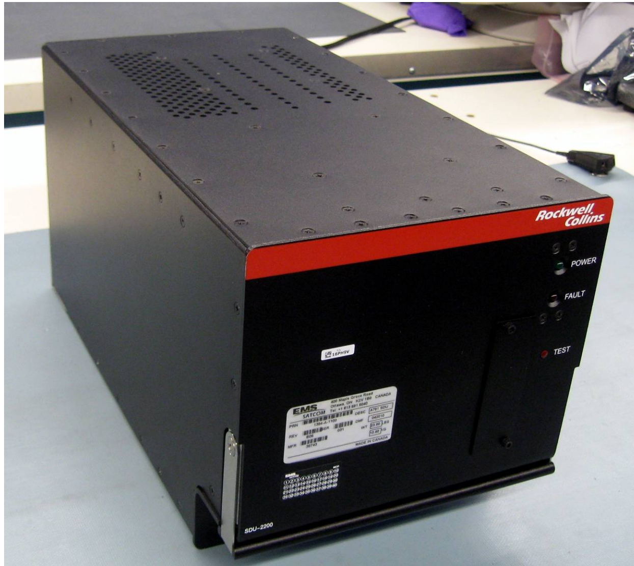
Figure 2: SDU Isometric View

CONFIDENTIAL, UNPUBLISHED PROPERTY OF ONE OR MORE OF THE FOLLOWING - EMS TECHNOLOGIES CANADA, LTD., FORMATION INC., SKY CONNECT LLC (COLLECTIVELY “EMS AVIATION”).