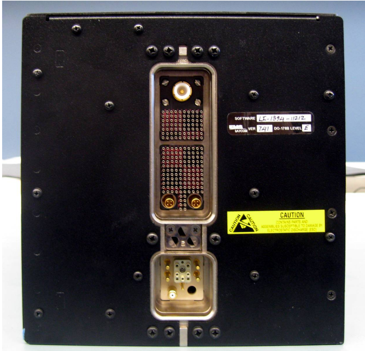
Figure 4: SDU Back View

CONFIDENTIAL, UNPUBLISHED PROPERTY OF ONE OR MORE OF THE FOLLOWING - EMS TECHNOLOGIES CANADA, LTD., FORMATION INC., SKY CONNECT LLC (COLLECTIVELY “EMS AVIATION”).