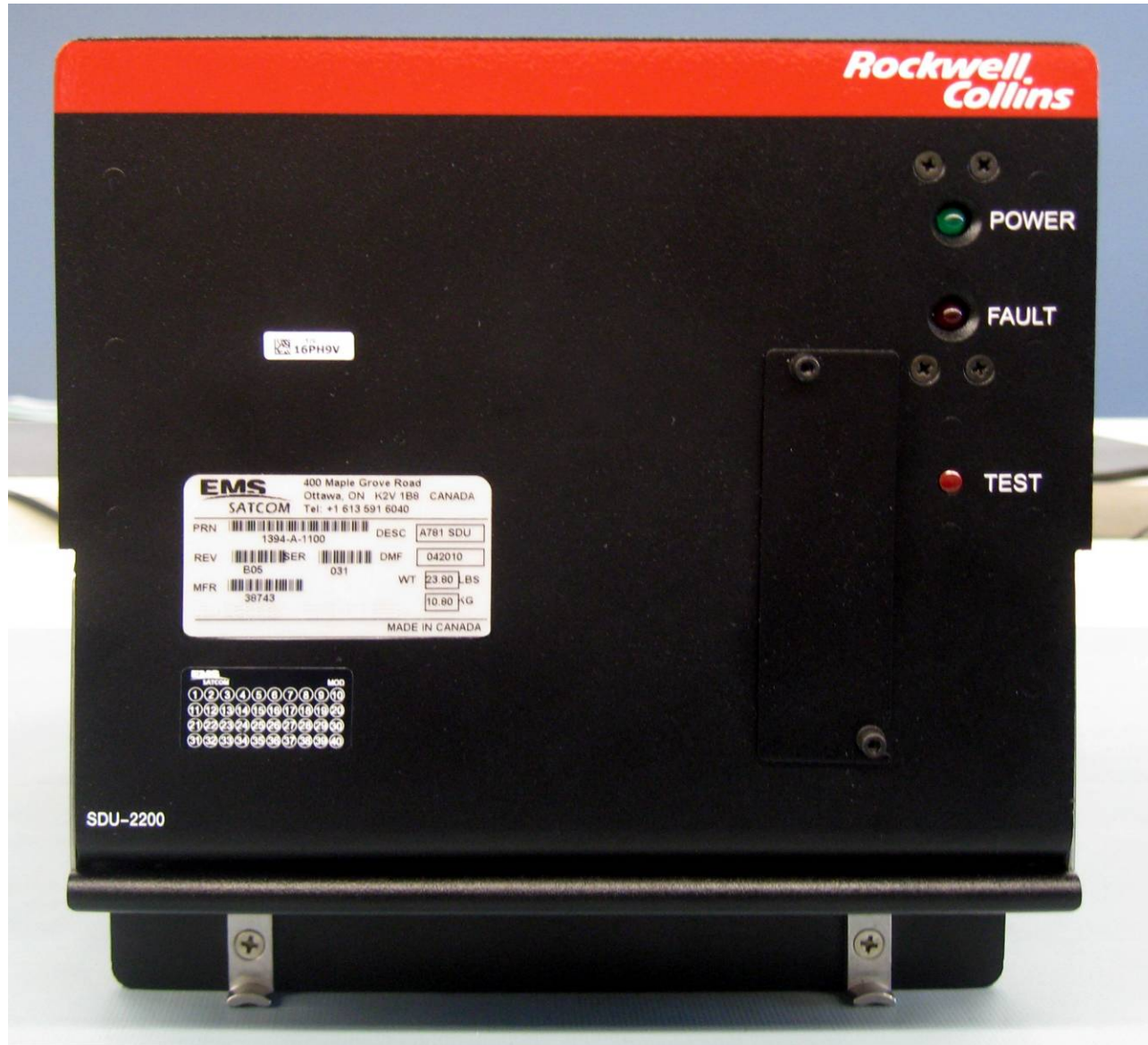
Figure 1: SDU Front View

CONFIDENTIAL, UNPUBLISHED PROPERTY OF ONE OR MORE OF THE FOLLOWING - EMS TECHNOLOGIES CANADA, LTD., FORMATION INC., SKY CONNECT LLC (COLLECTIVELY “EMS AVIATION”).