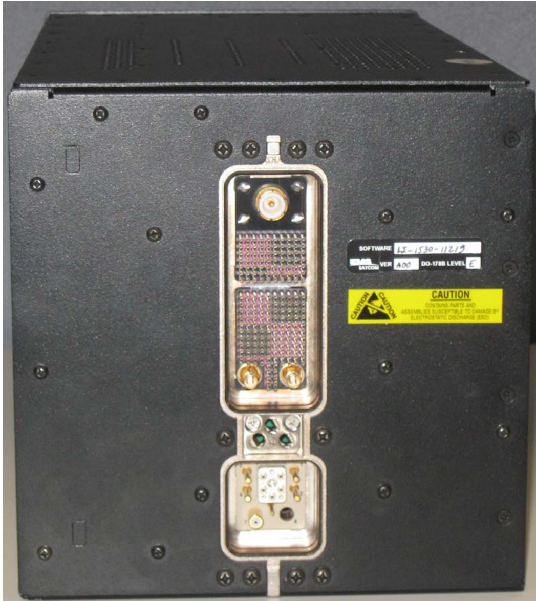
Figure 4: SDU Back View

CONFIDENTIAL, UNPUBLISHED PROPERTY OF ONE OR MORE OF THE FOLLOWING - EMS TECHNOLOGIES CANADA, LTD., FORMATION INC., SKY CONNECT LLC (COLLECTIVELY "EMS AVIATION").