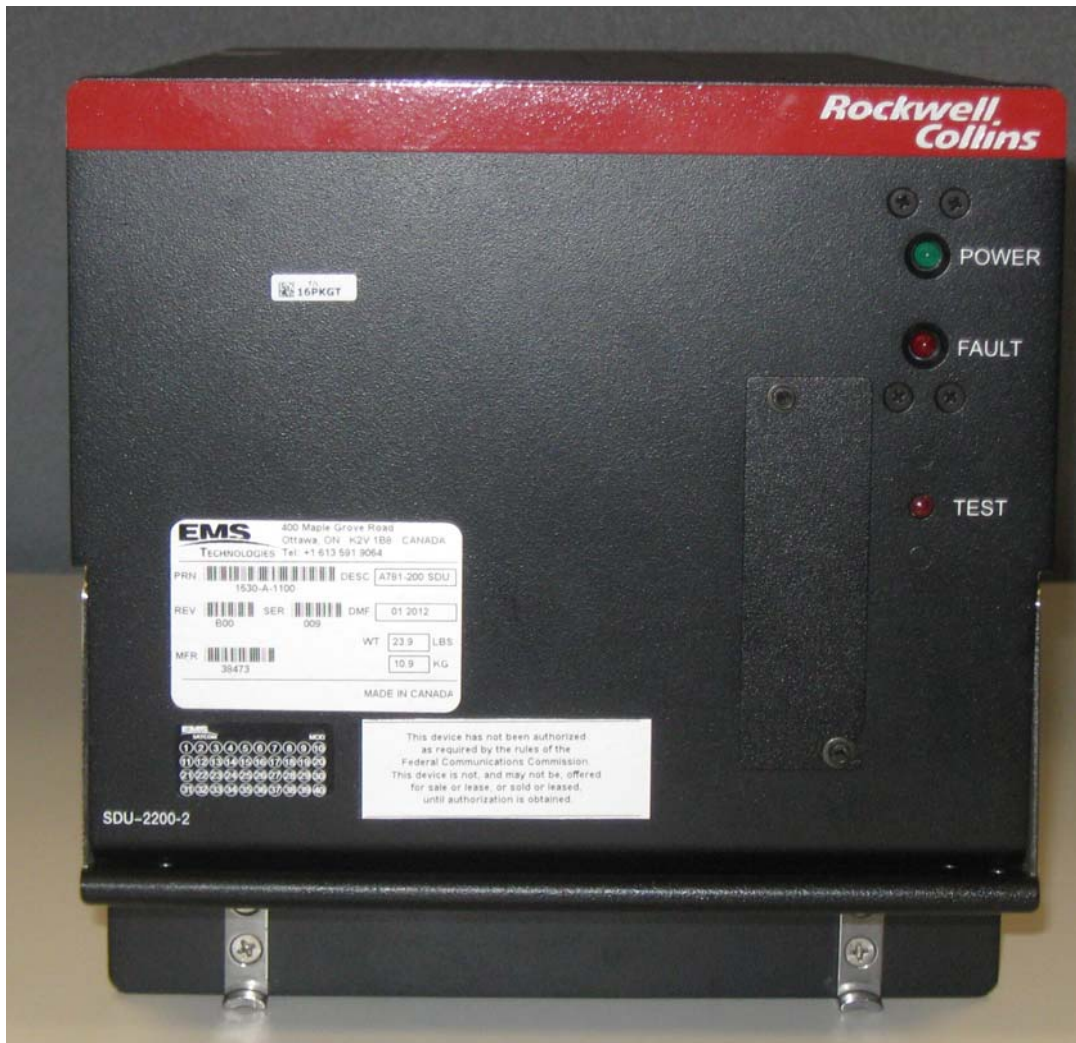
Figure 1: SDU Front View

CONFIDENTIAL, UNPUBLISHED PROPERTY OF ONE OR MORE OF THE FOLLOWING - EMS TECHNOLOGIES CANADA, LTD., FORMATION INC., SKY CONNECT LLC (COLLECTIVELY "EMS AVIATION").