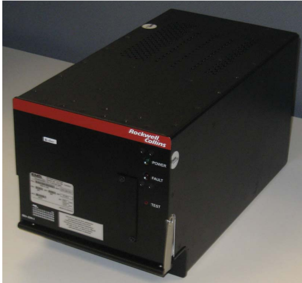
Figure 2: SDU Isometric View

CONFIDENTIAL, UNPUBLISHED PROPERTY OF ONE OR MORE OF THE FOLLOWING - EMS TECHNOLOGIES CANADA, LTD., FORMATION INC., SKY CONNECT LLC (COLLECTIVELY "EMS AVIATION").