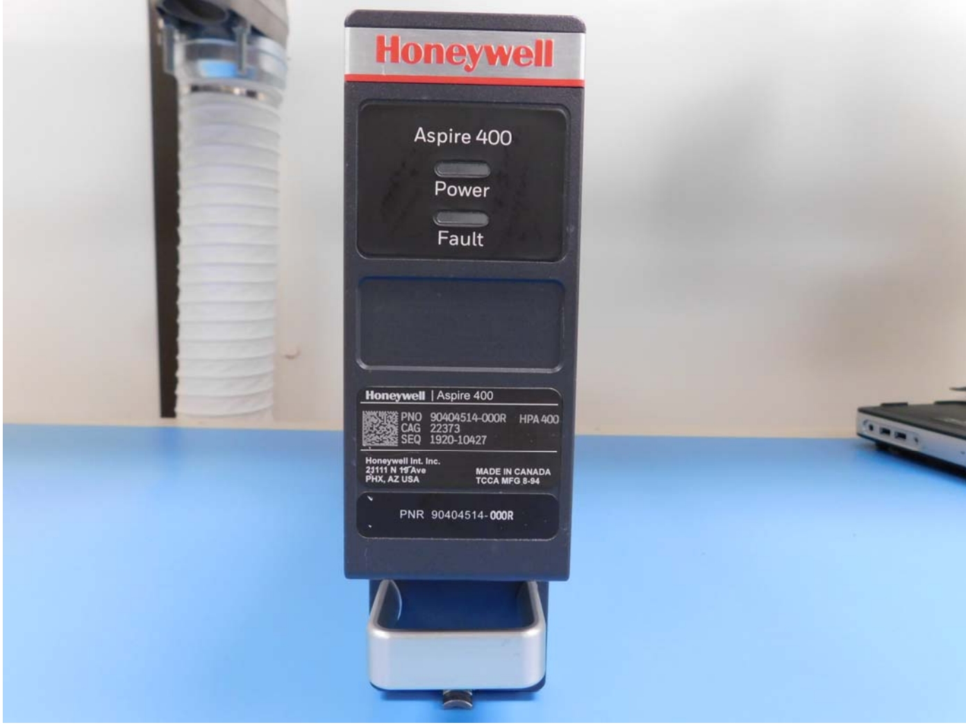
Figure 1: HPA Front View