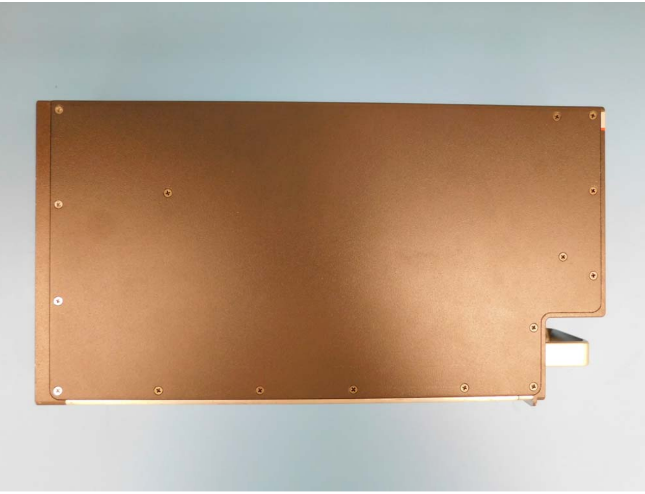
Figure 3: HPA Side View