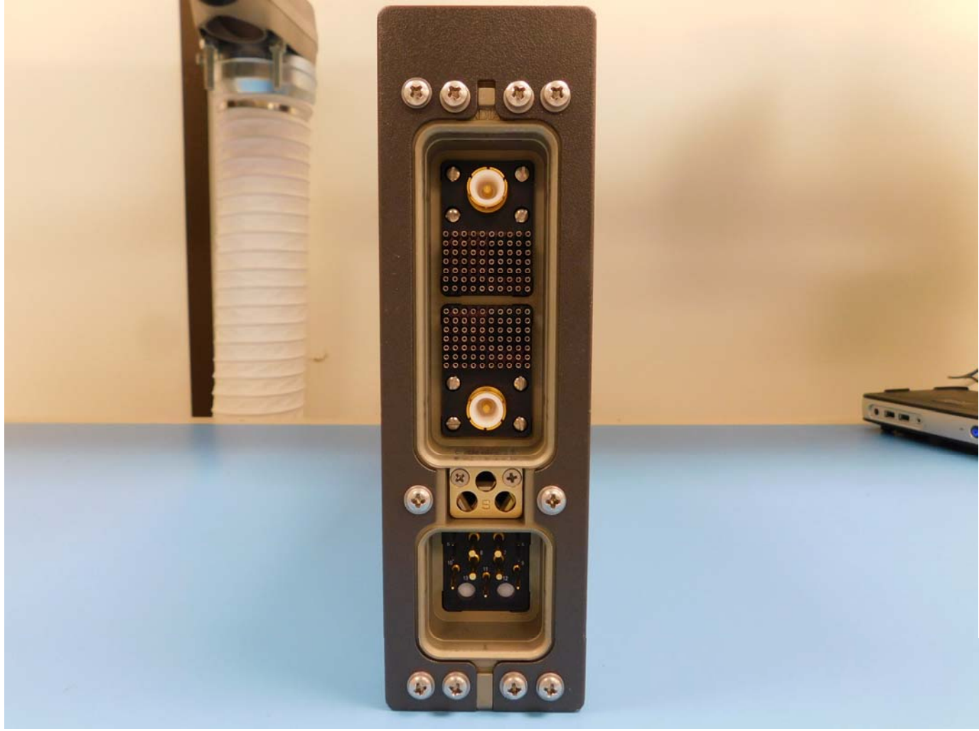
Figure 4: HPA Back View