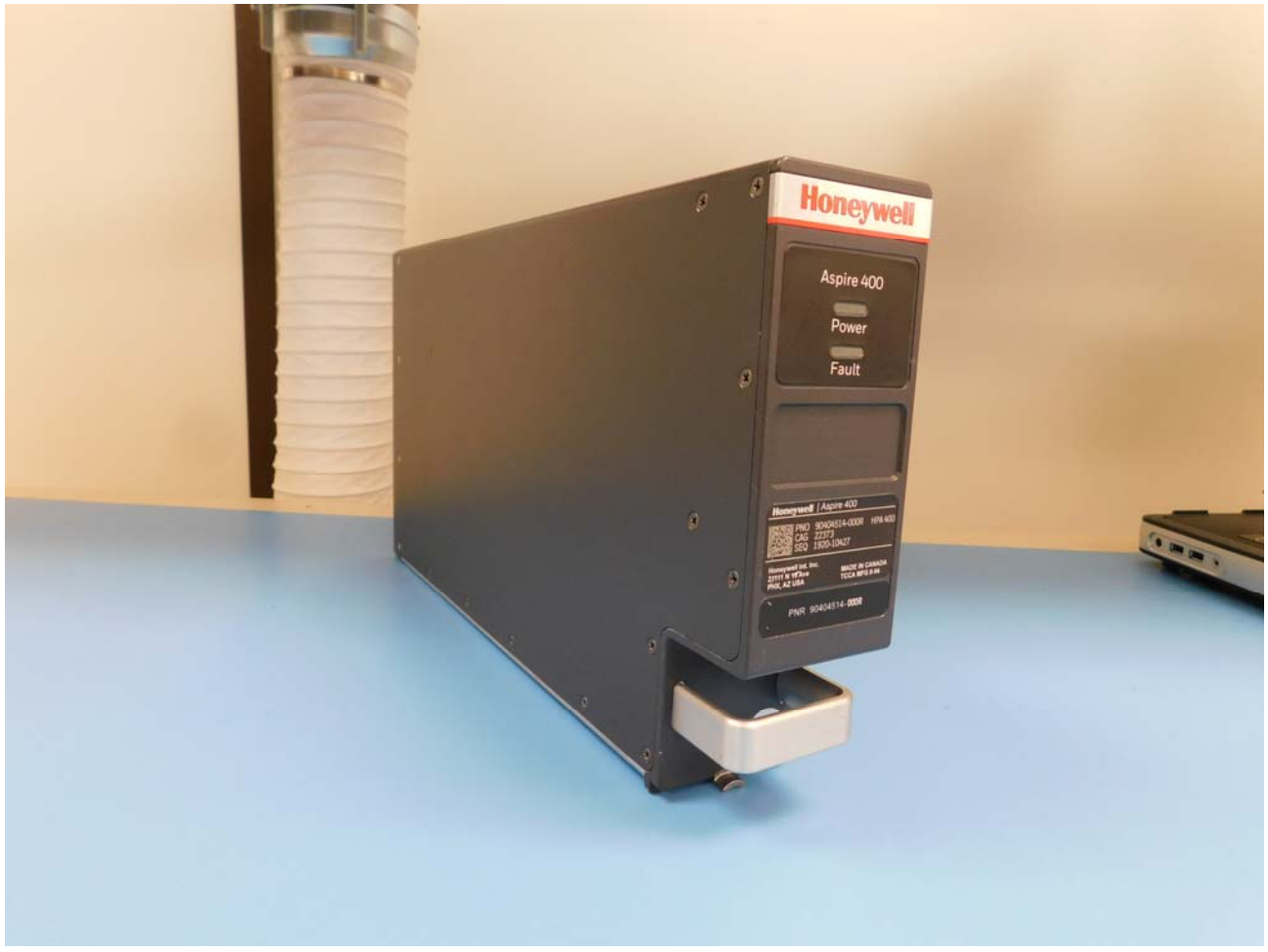
Figure 2: HPA Isometric View