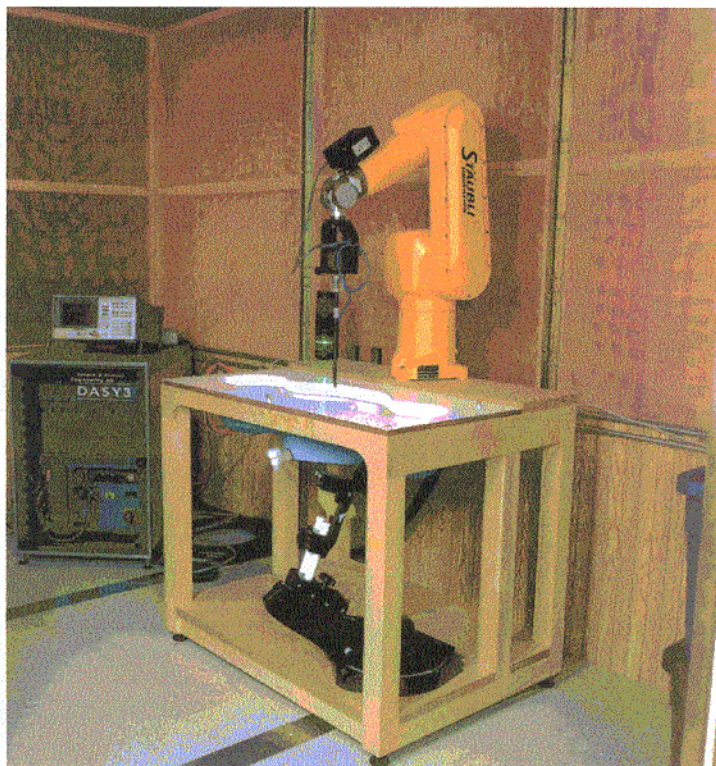
DASY3 SAR Measurement System