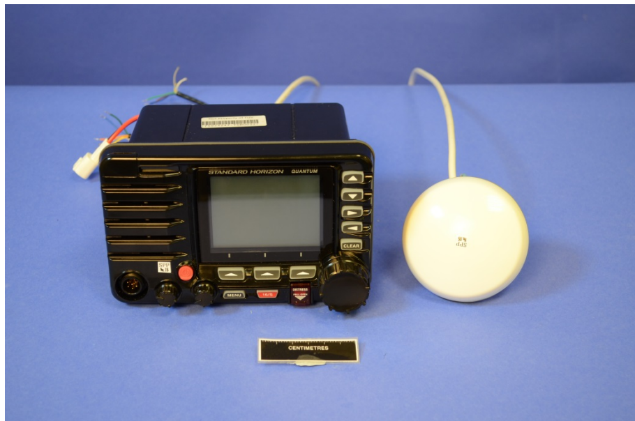
Equipment Under Test

The Equipment Under Test (EUT) was a Yaesu UK Ltd GX6500 and GX6000 as shown in the photograph below. A full technical description can be found in the manufacturer's documentation.