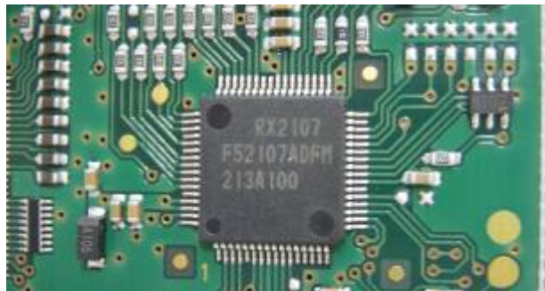
Fig.4-2 CNTL-2-UNIT (Close up 1C / New)