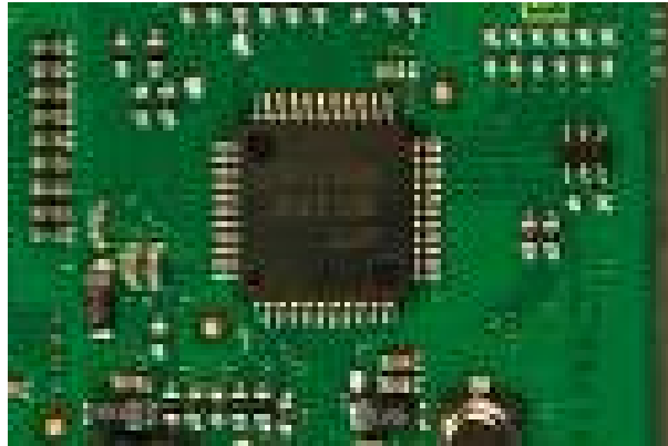
Fig.4-1 CNTL-2-UNIT (Close up 1C / Old)