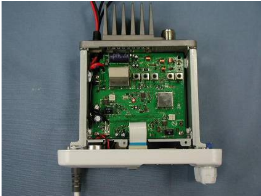
Fig.1-1 MAIN-UNIT (Old)