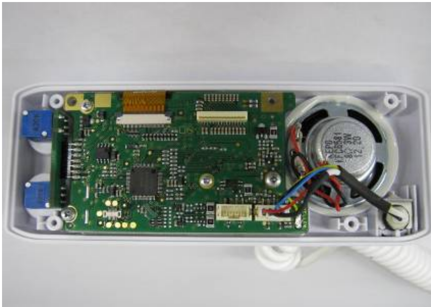
Fig.3-2 CNTL-2-UNIT (New)