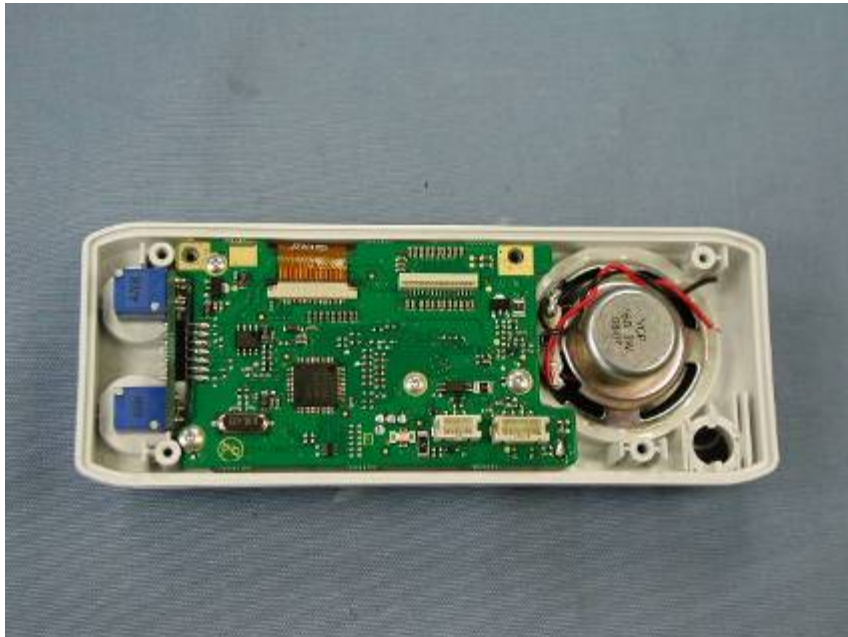
Fig.3-1 CNTL-2-UNIT (Old)