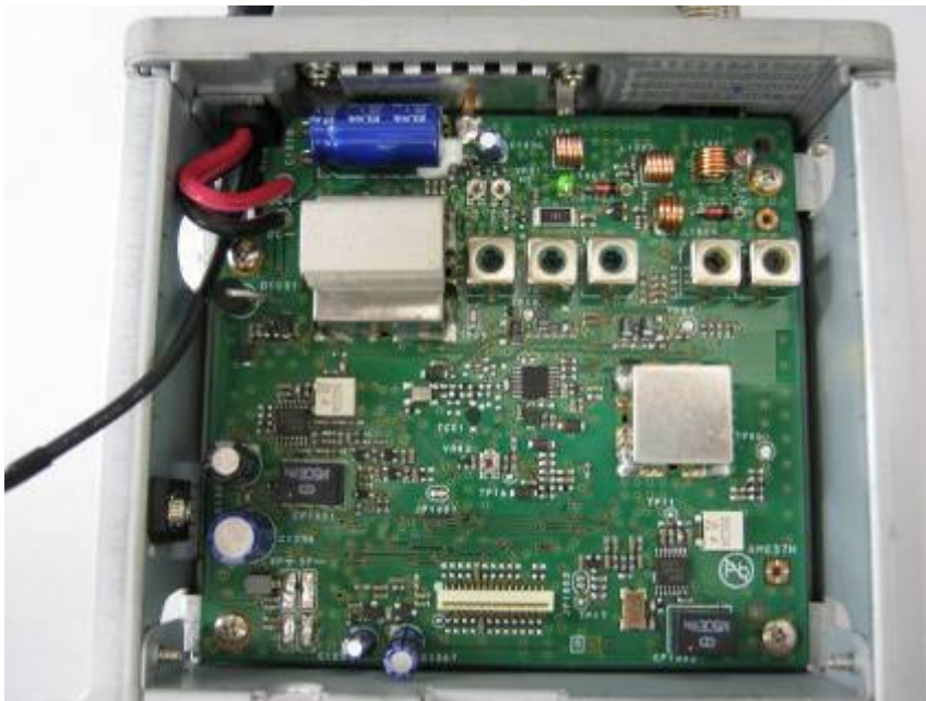
Fig.1-2 MAIN-UNIT (New)