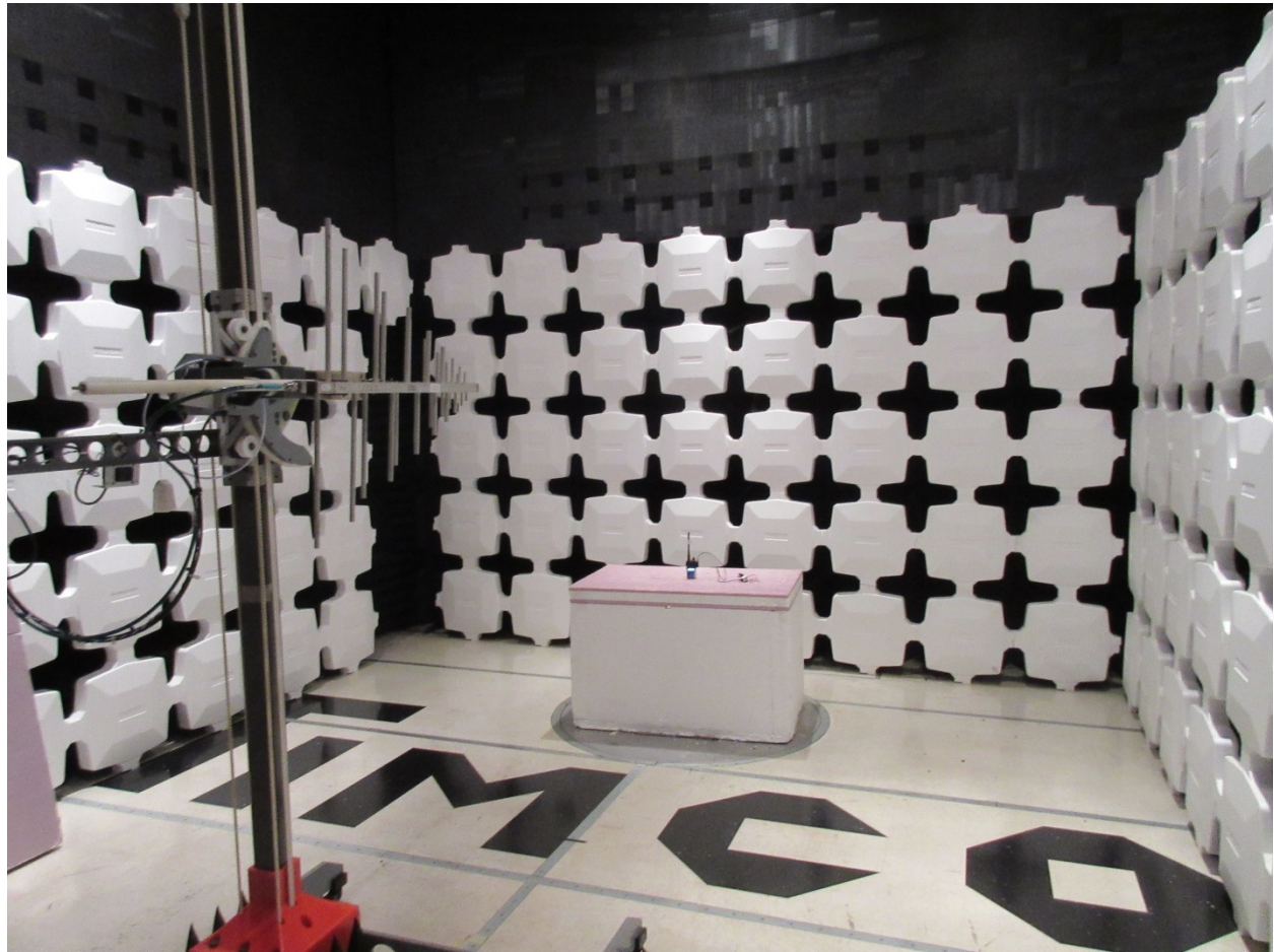
Radiated Setup Below 1GHz