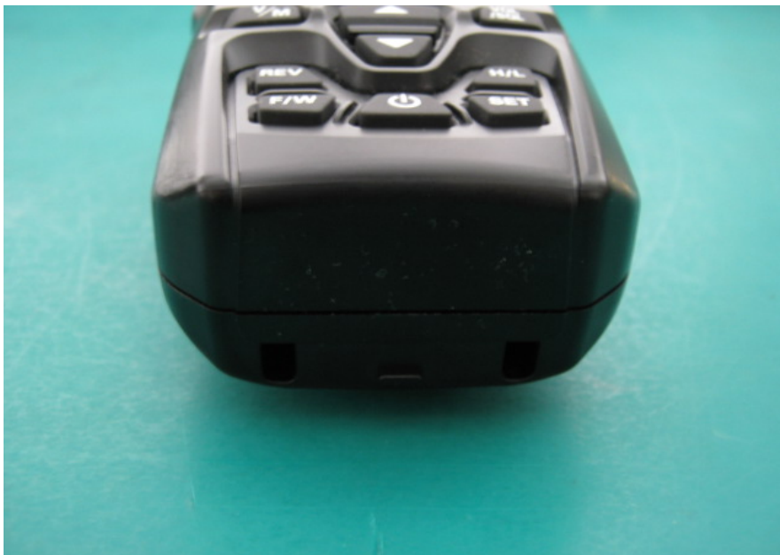
Fig.3-2 Bottom View