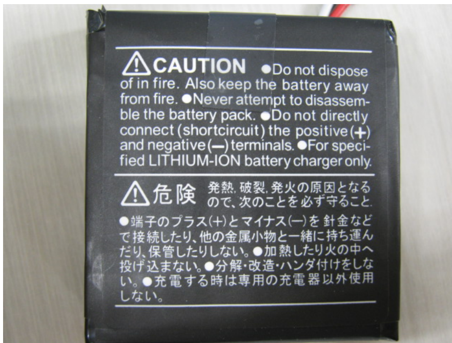
Fig.5-2 FNB-124LI (Angle-3)