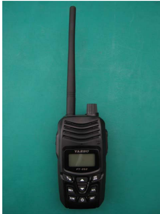
Fig.1-1 Front View