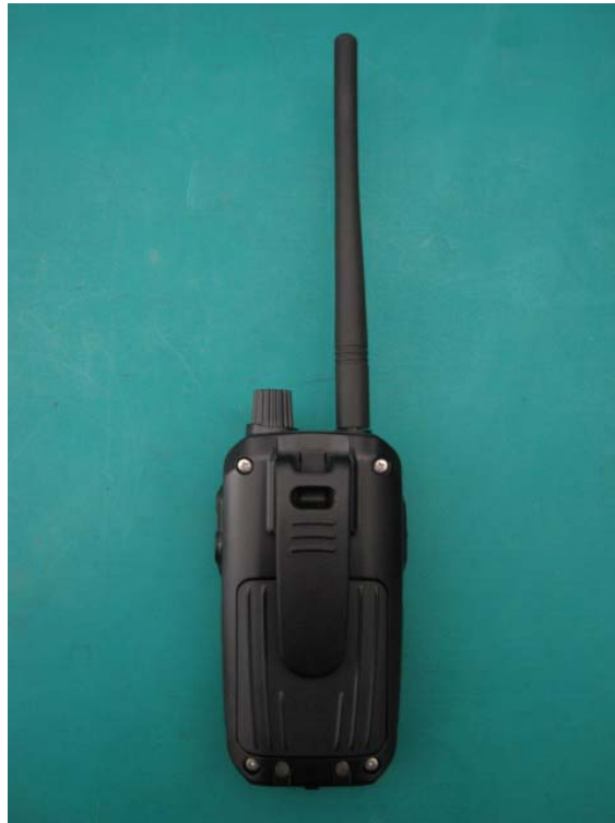
Fig.1-3 Back View