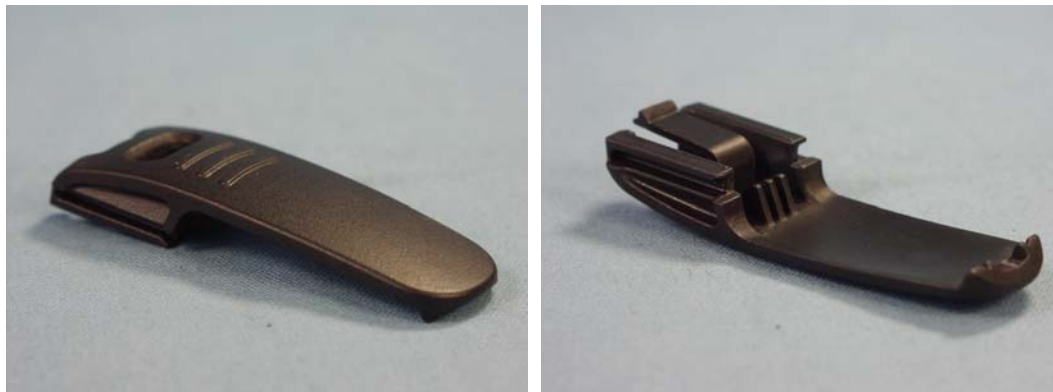
Fig.4-2 Belt Clip