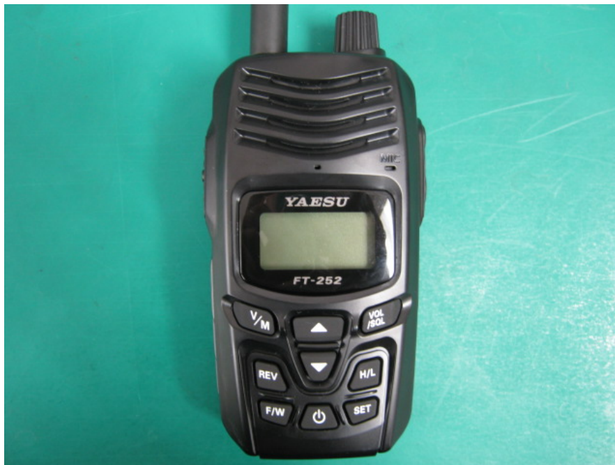
Fig.1-2 Front View (Close up)