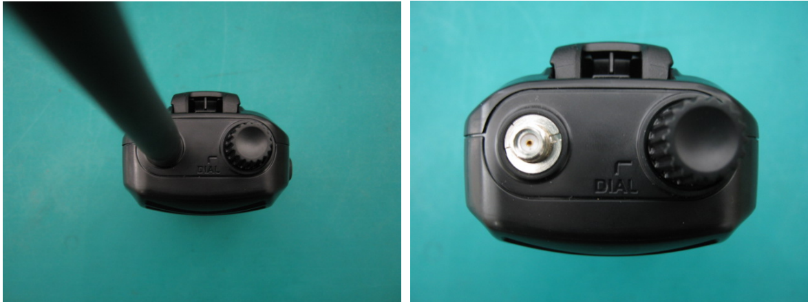
Fig.3-1 Top View