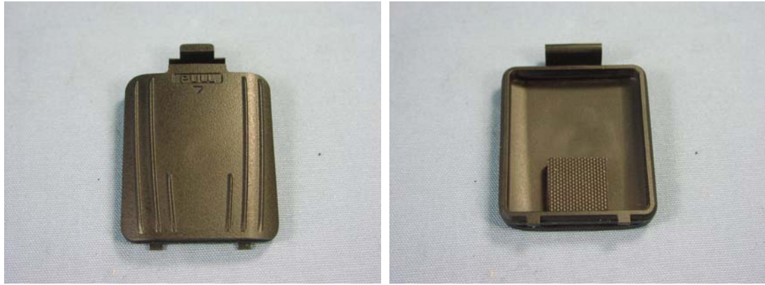
Fig.4-1 Battery Case