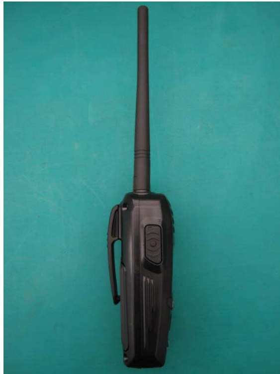
Fig.2-1 Left View