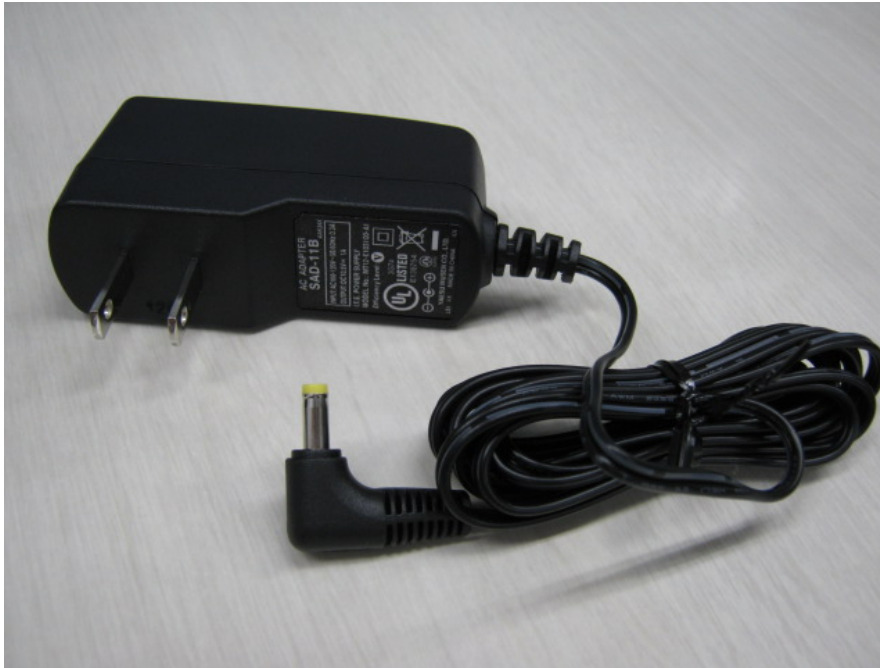
Fig.6-1 AC Adapter (SAD-11B)