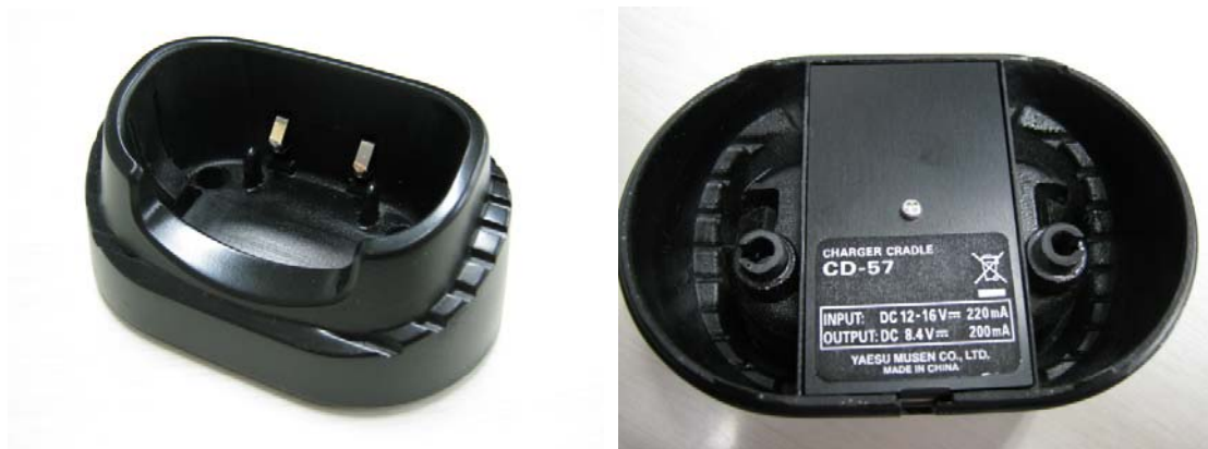
Fig.6-2 Charger (CD-57)