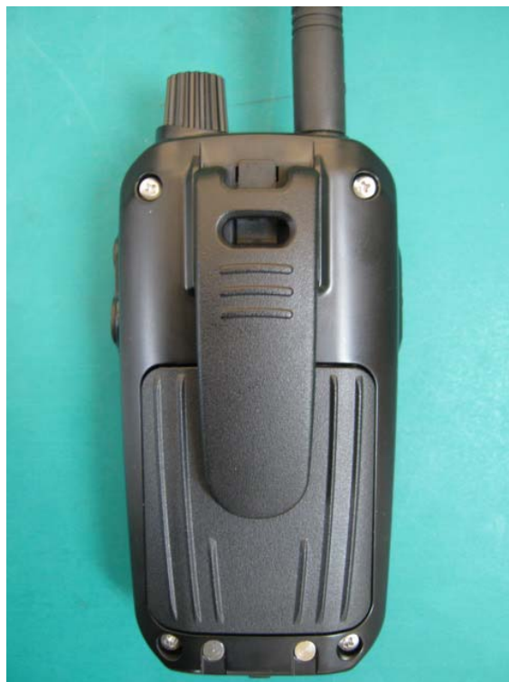
Fig.1-4 Back View (Close up)