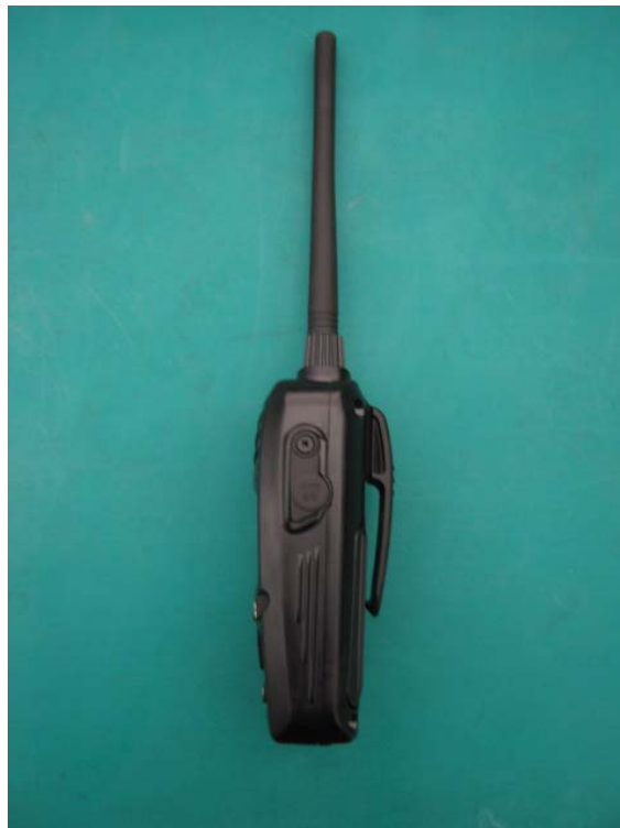
Fig.2-2 Right View