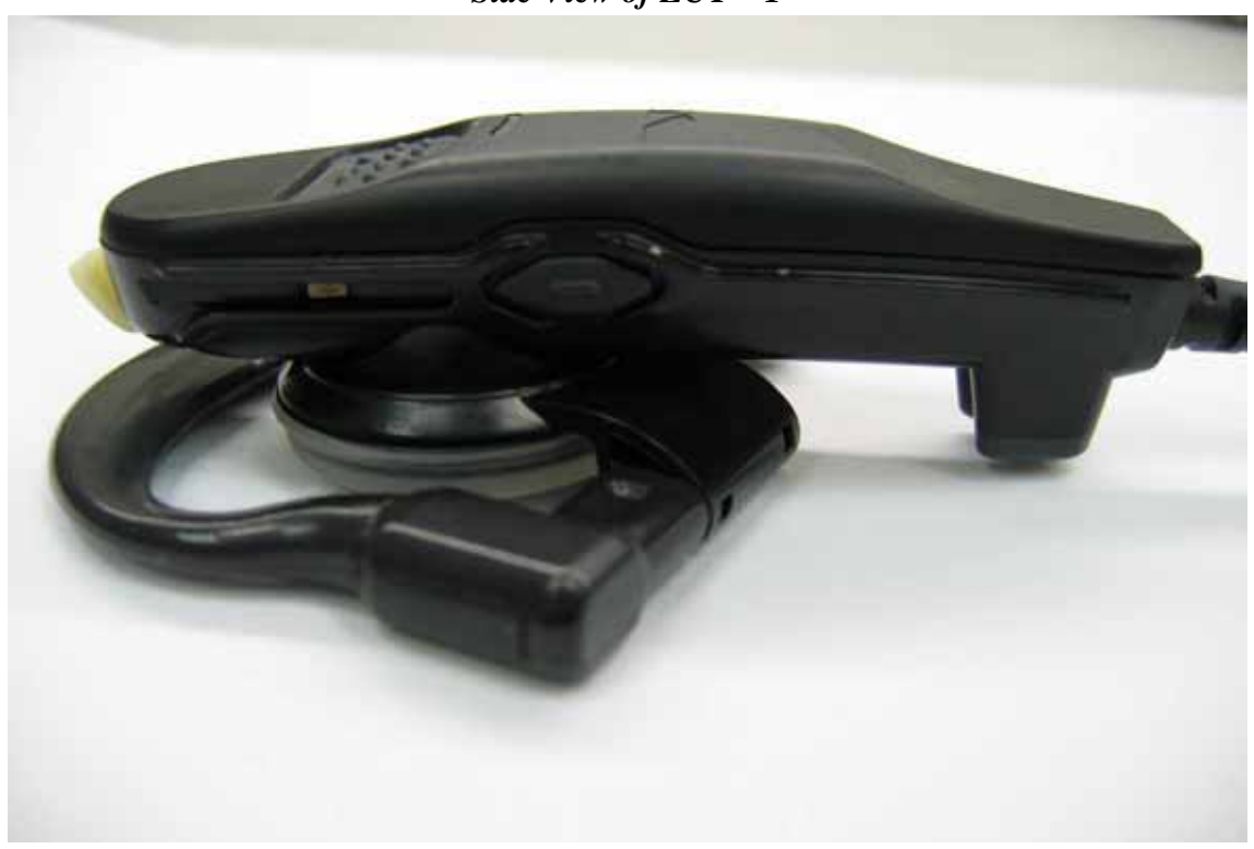
Side View of EUT - 2