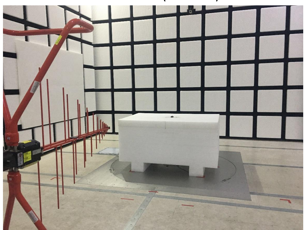
Radiated Emission (Below 1 GHz)