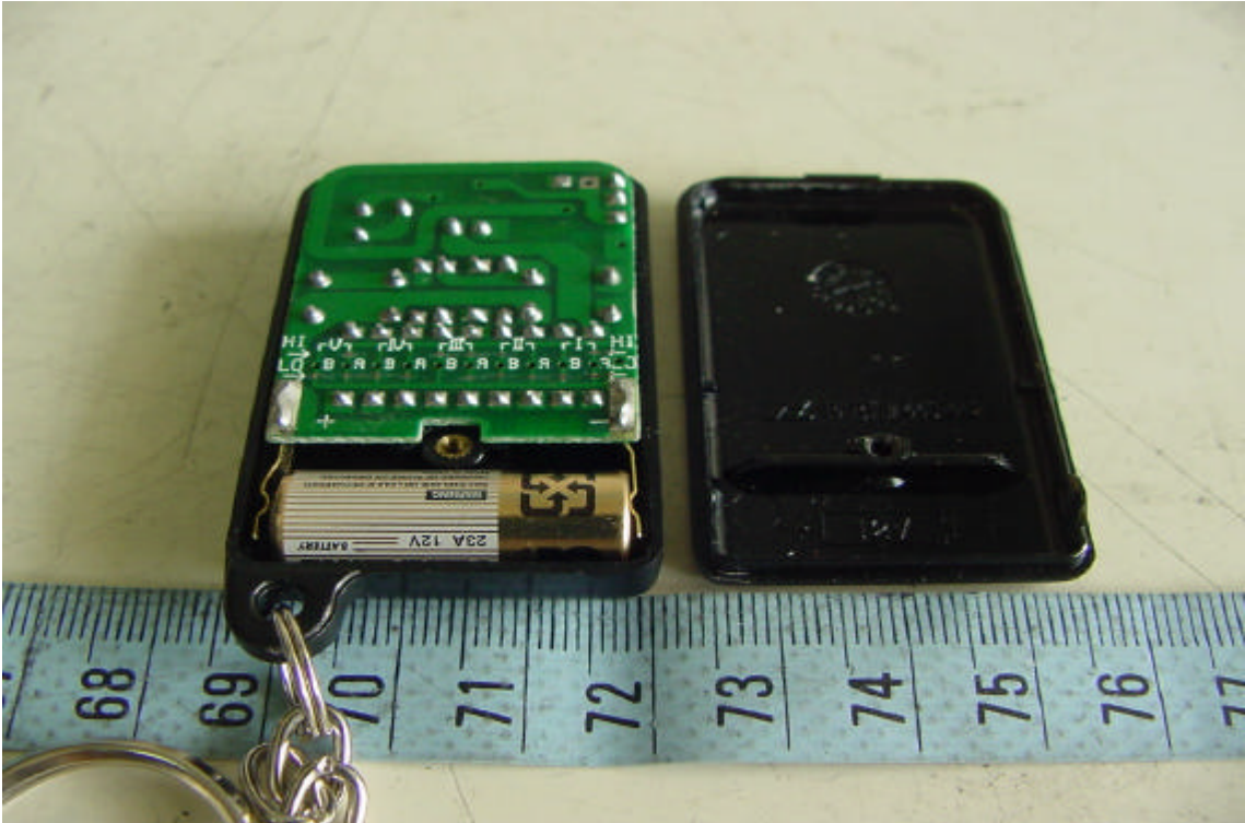
Component View of Main PCB