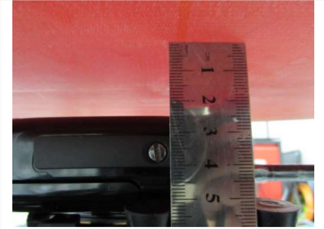
Distance of 25 mm from the EUT