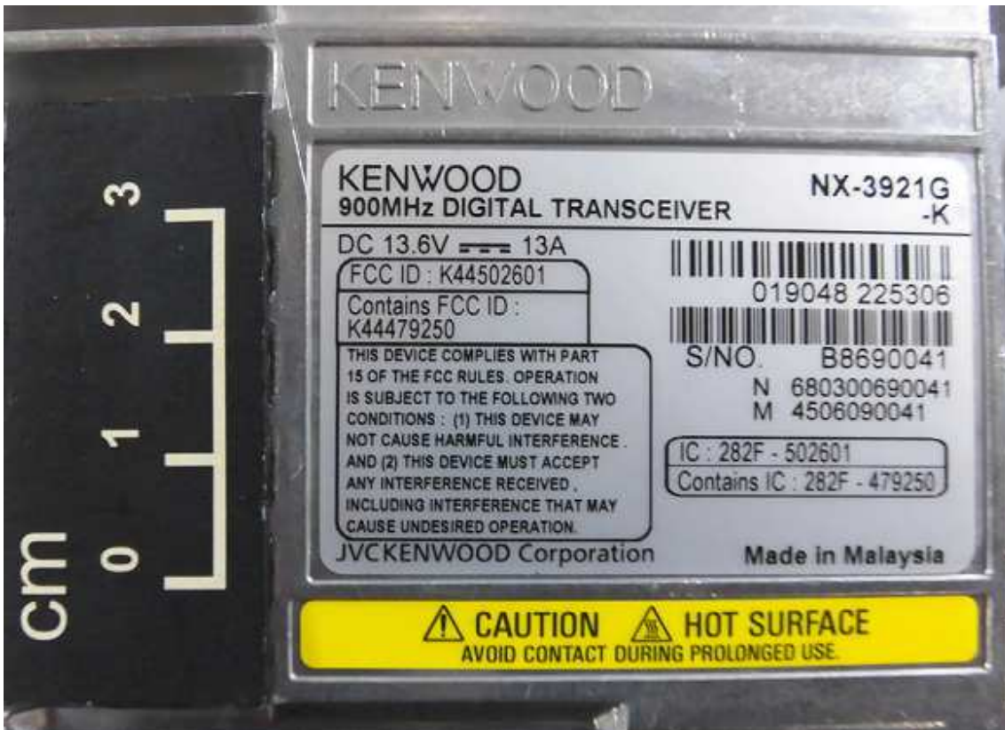
MODEL NAME PLATE LABEL