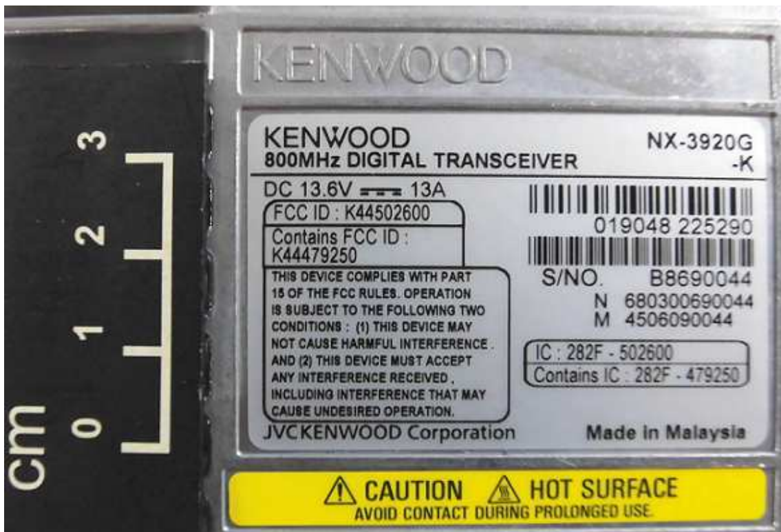
MODEL NAME PLATE LABEL