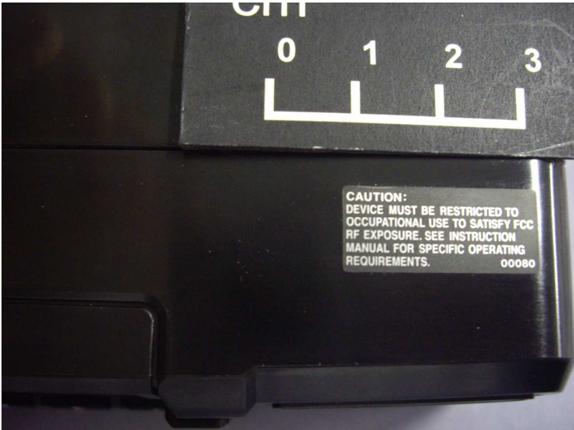
CAUTION STICKER LABEL