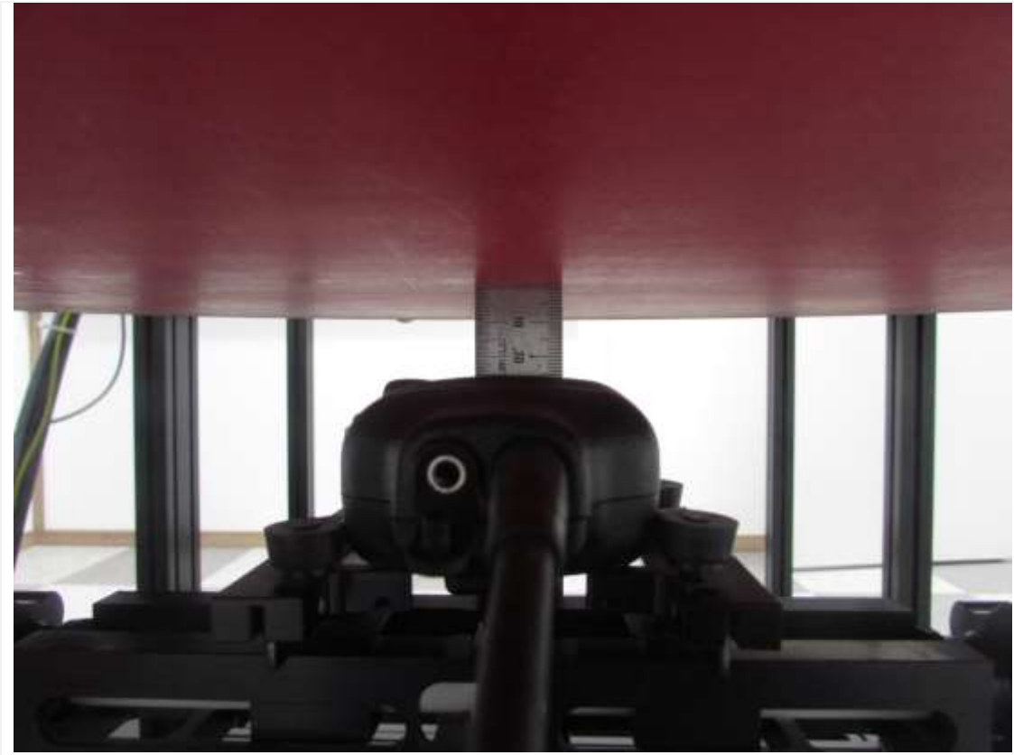
Distance of 25 mm from the EUT