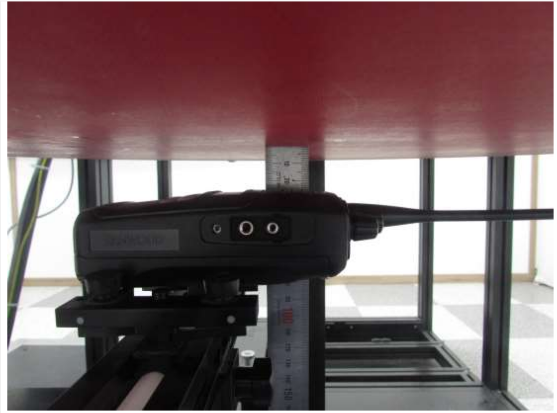
Distance of 25 mm from the EUT