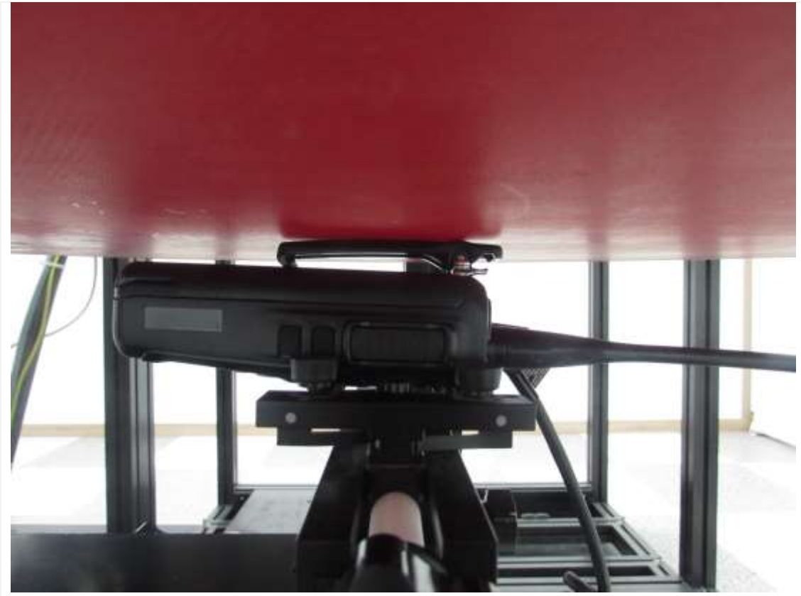
Distance of 0 mm from the EUT