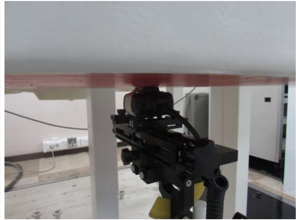
Distance of 0 mm from the EUT