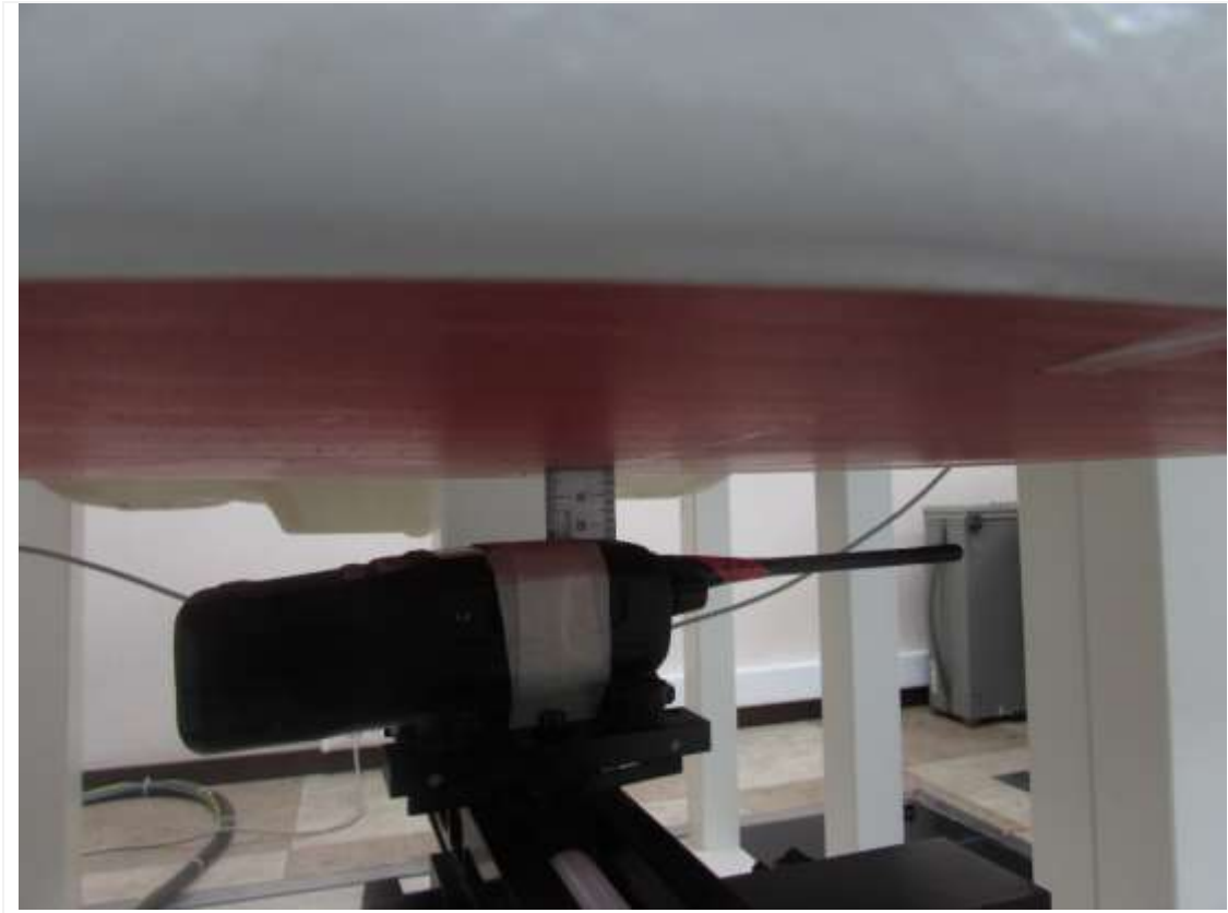
Distance of 25 mm from the EUT