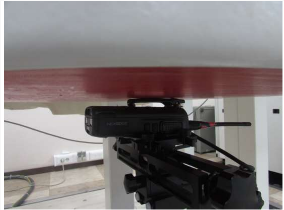
Distance of 0 mm from the EUT