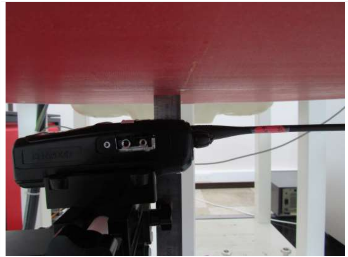
Distance of 25 mm from the EUT