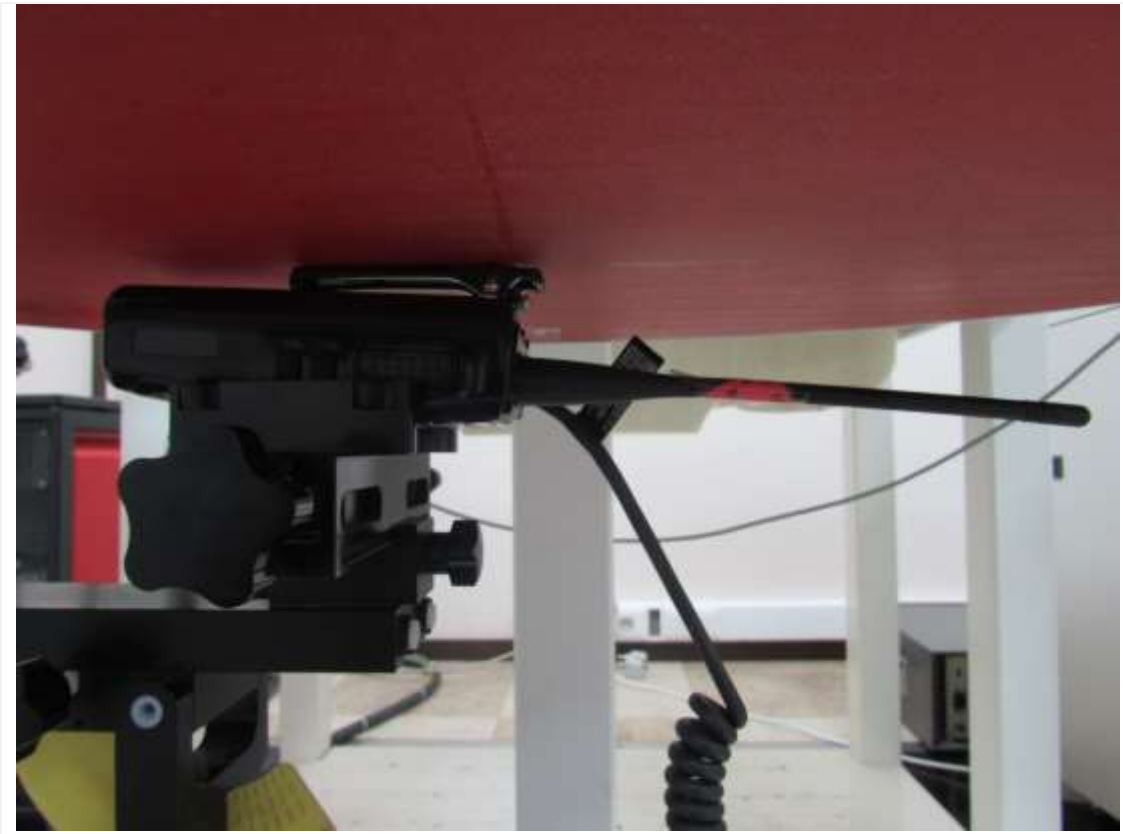
Distance of 0 mm from the EUT