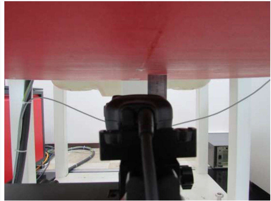
Distance of 25 mm from the EUT