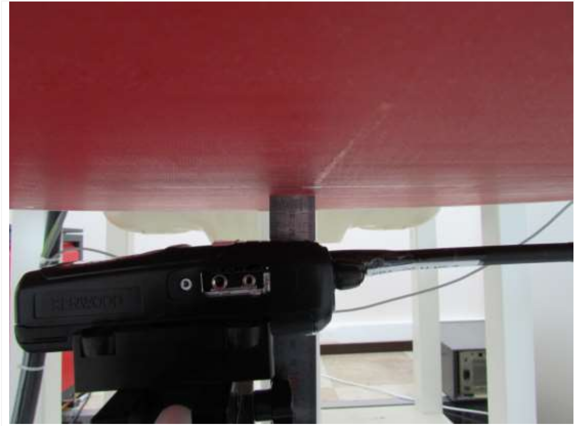
Distance of 25 mm from the EUT