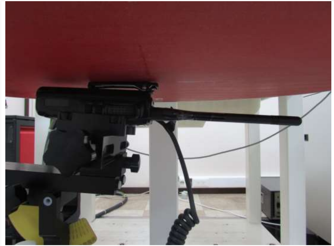
Distance of 0 mm from the EUT