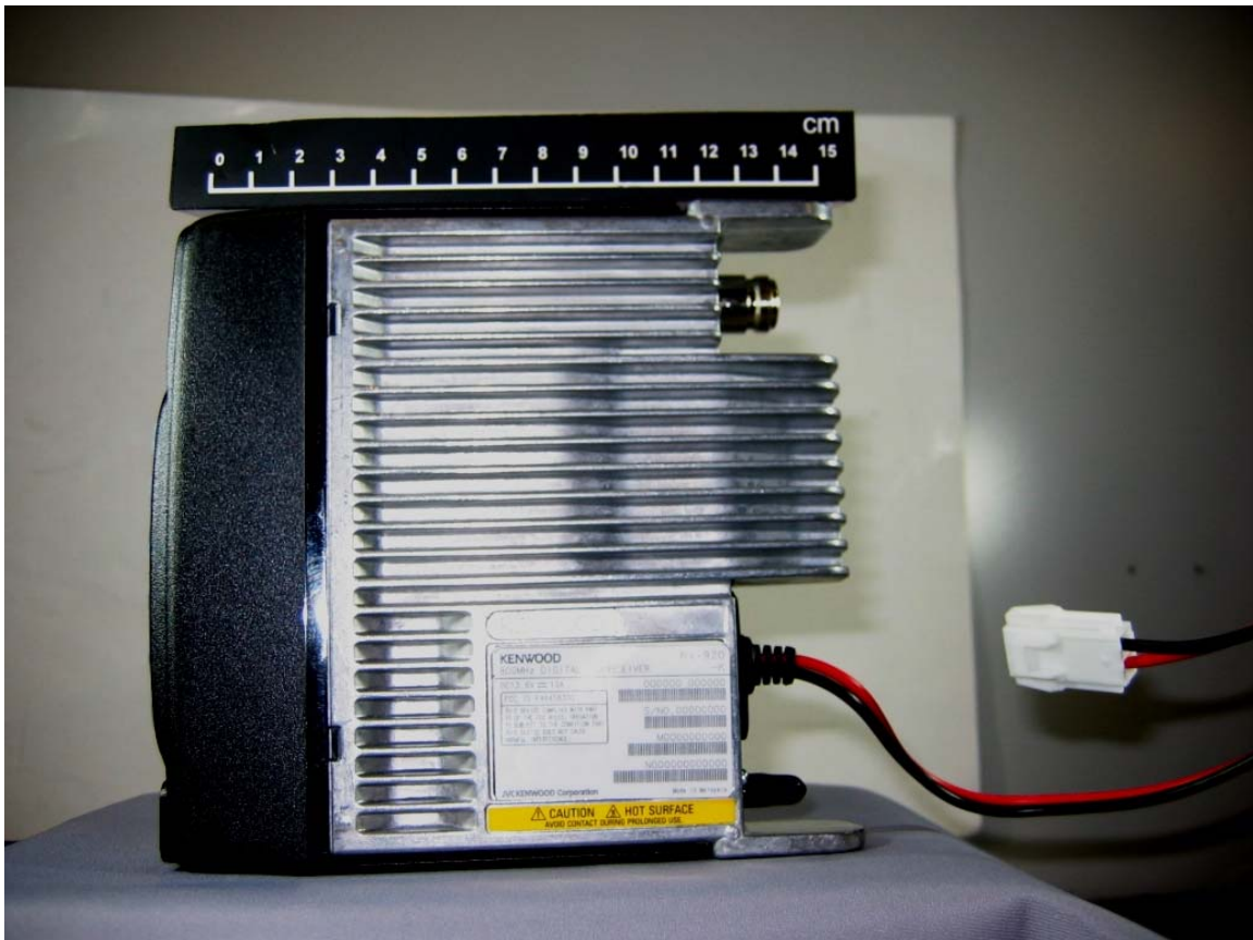
Bottom View (TK-920-K)

NX-920G-K, NX-920-K FCC ID: K44458300 IC: 282F-458300