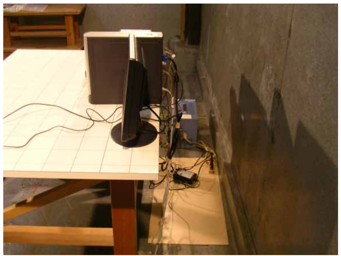
Note: Maintaining 10cm spacing between all the equipment cabinets.

© ETL SEMKO Japan K.K. Page 2 of 3 Version 0.0