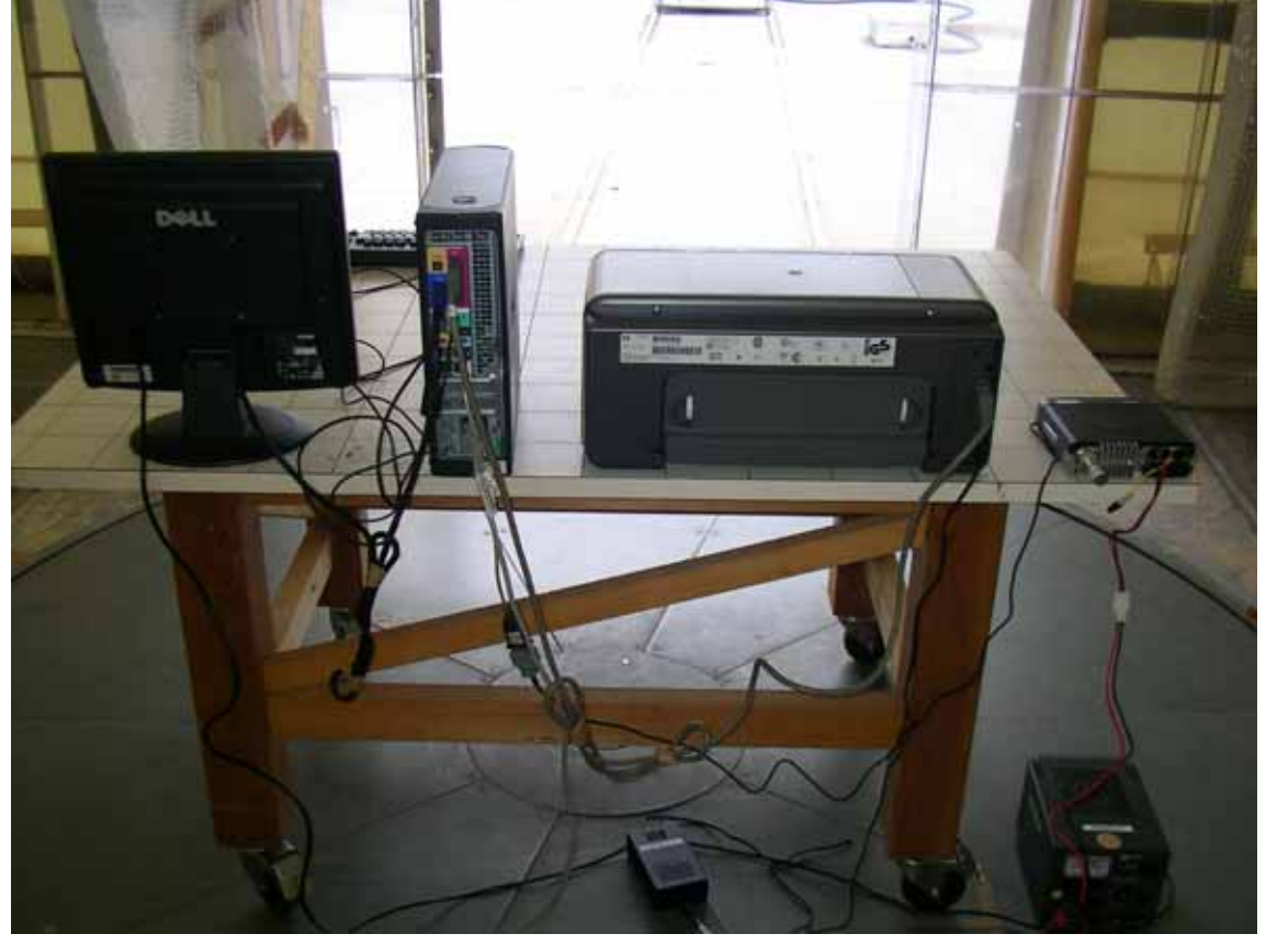
Note: Maintaining 10cm spacing between all the equipment cabinets.