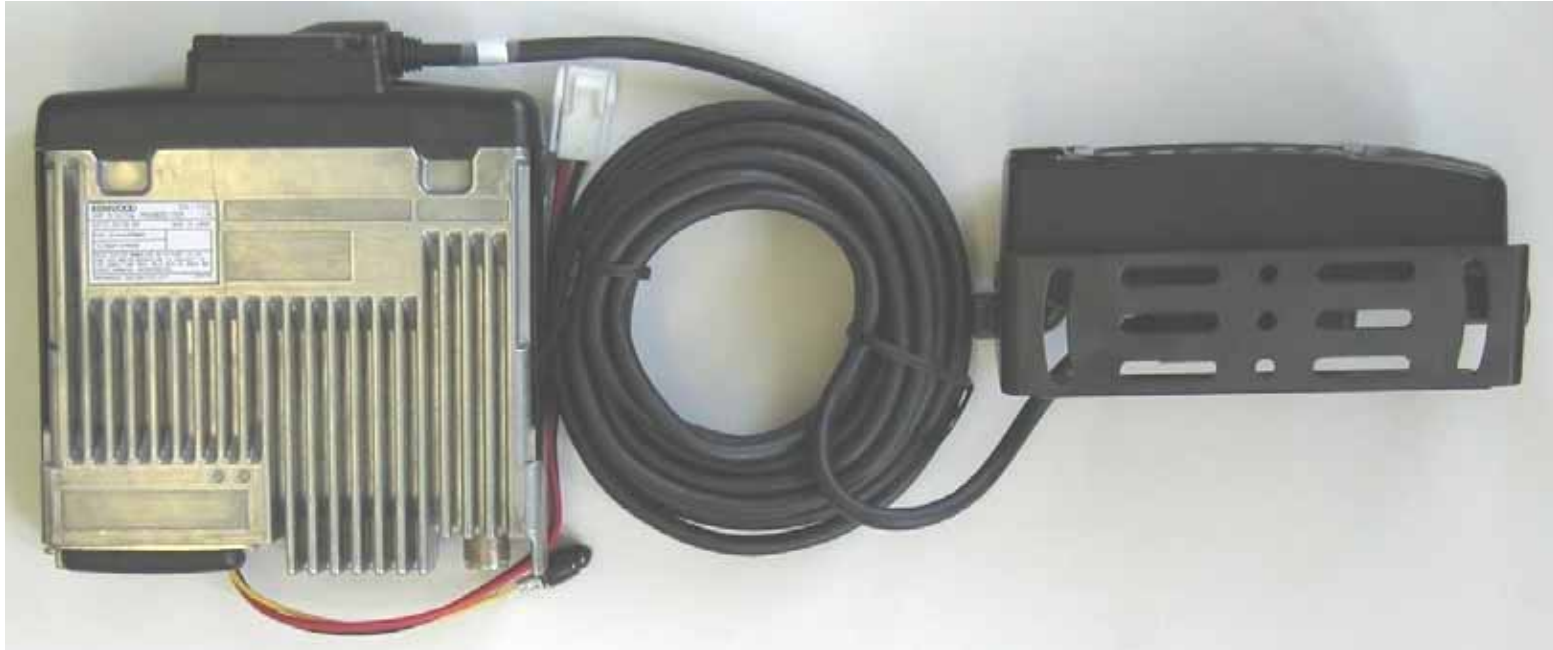
Rear View (with KRK-10)

FCC ID: K44378600 Model : NX-700-K IC: 282F-378600