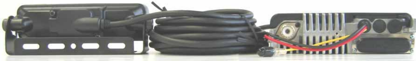
Rear View (with KRK-10)