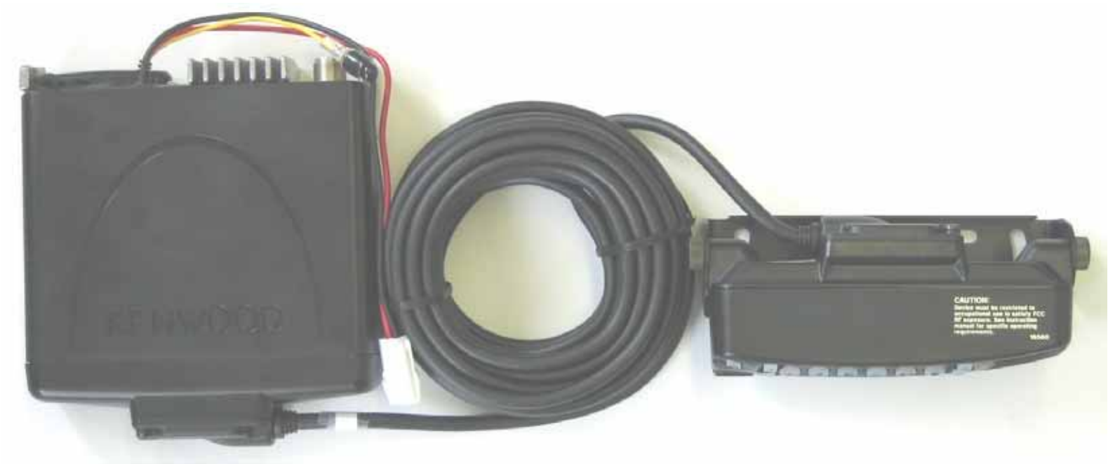
Top View (with KRK-10)

FCC ID: K44378600 Model : NX-700-K IC: 282F-378600