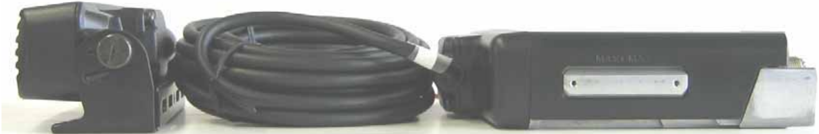
Right View (with KRK-10)

FCC ID: K44378600 Model : NX-700-K IC: 282F-378600