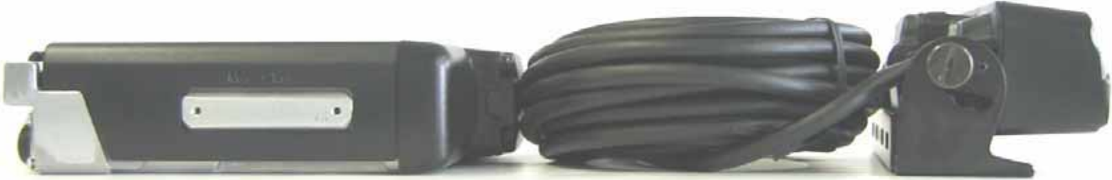
Left View (with KRK-10)