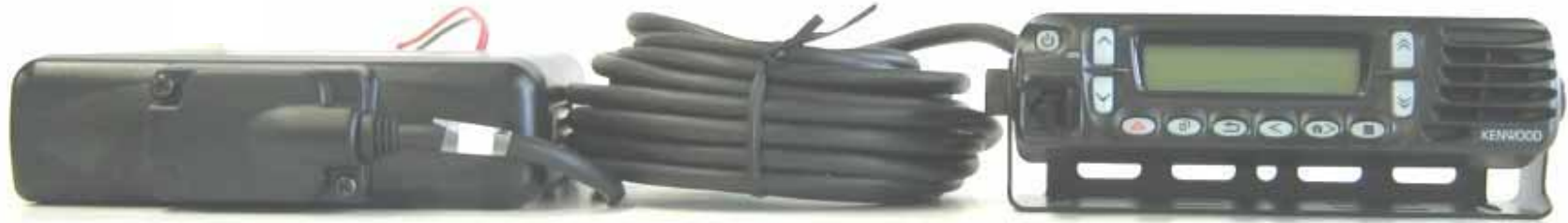
Front View (with KRK-10)

FCC ID: K44378600 Model : NX-700-K IC: 282F-378600