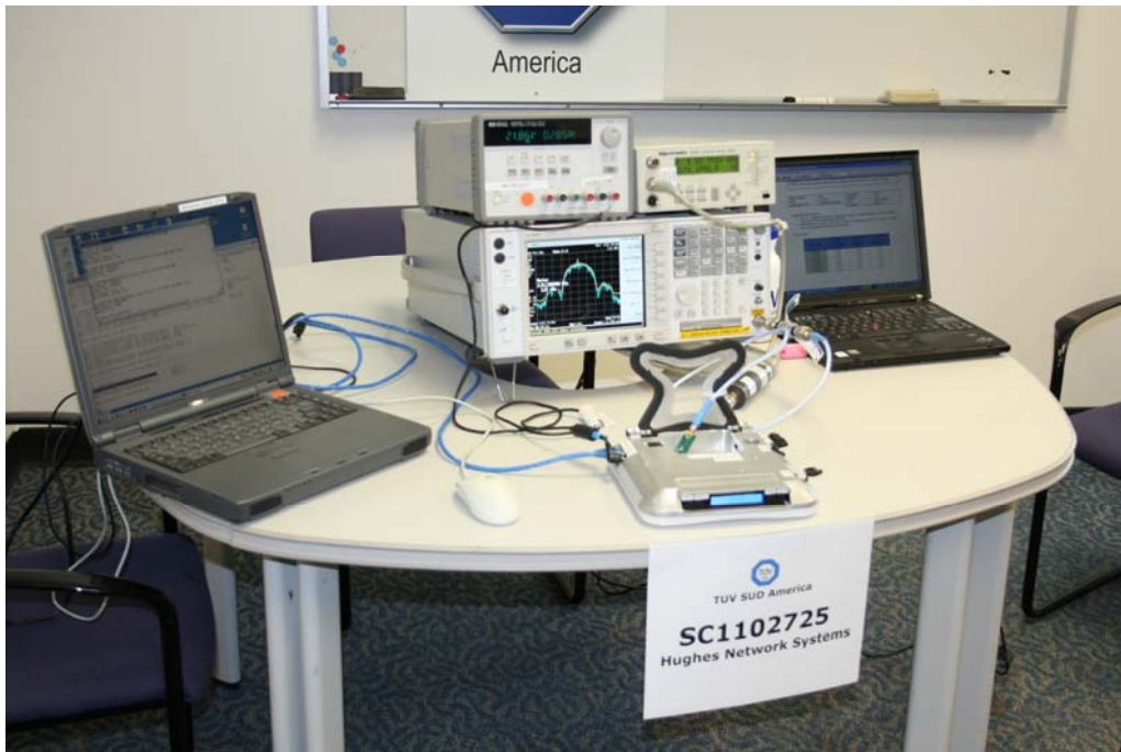
Conducted Port Test Setup