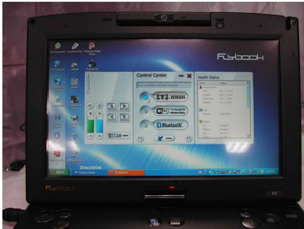
Fig. 1: in the laptop mode, WWAN and WiFi can be enabled either by Flybook Control Center or hot key (Fn+F9 for WWAN or Fn+F8 for WiFi)