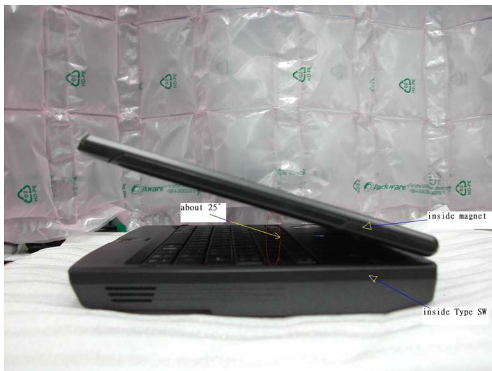
Fig. 4: in the process of changing to tablet PC mode, when the angle is smaller than 25 degree, Type Switch on the main board will sense the magnet inside of the panel and then turn off WWAN and WiFi. The relative location of Type SW and magnet are shown in the figure. The hinge can lock the panel in fixed location.