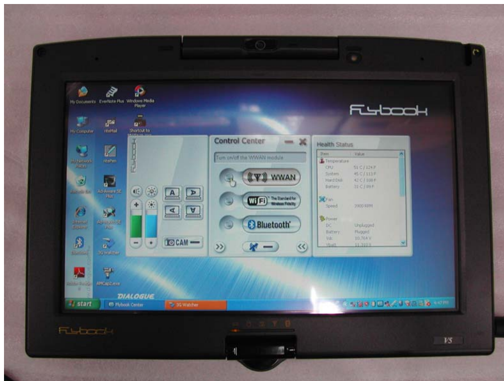
Fig. 3: in the tablet PC mode, hot-key and Flybook Control Center for WWAN and WiFi are disabled.