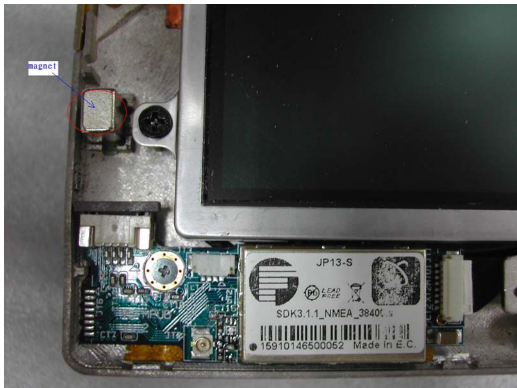
Fig. 6: the location of magnet inside of the panel