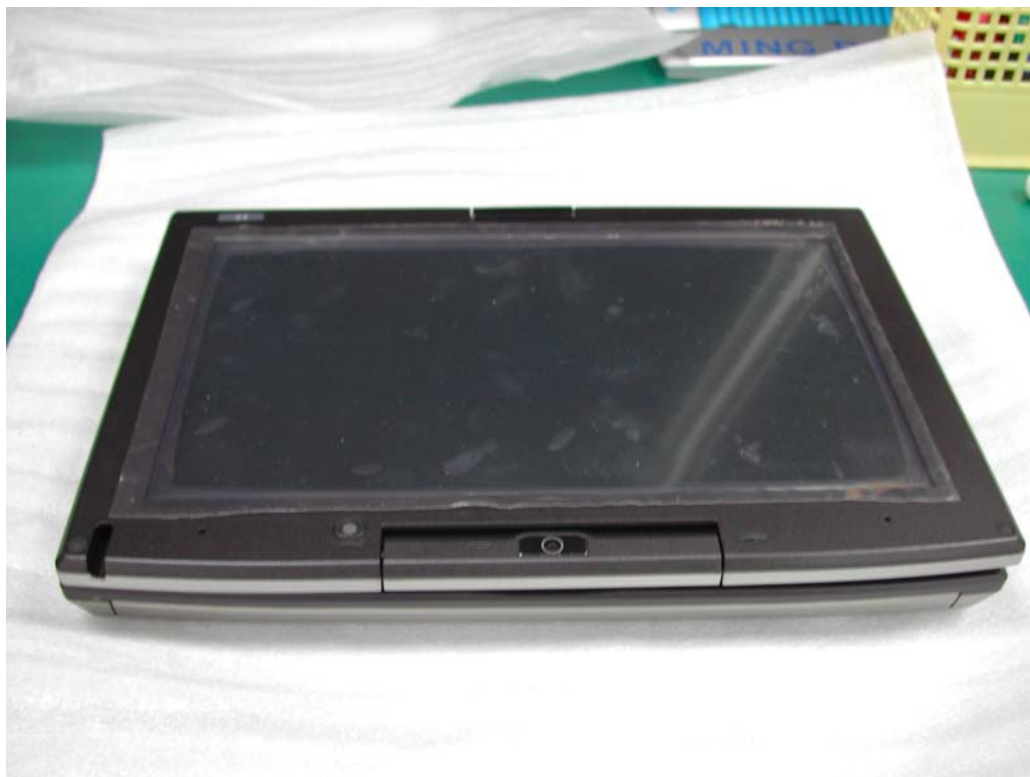
Fig. 2: the photo of the tablet PC mode