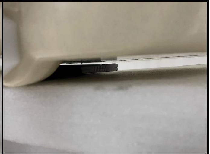
Horizontal-Down of EUT with 0.5 cm Gap