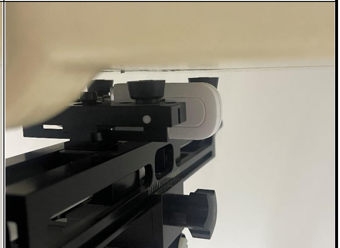
Vertical-Back of EUT with 0.5 cm Gap