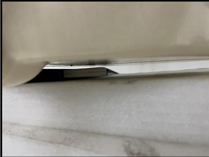
Horizontal-Up of EUT with 0.5 cm Gap