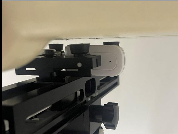
Vertical-Front of EUT with 0.5 cm Gap