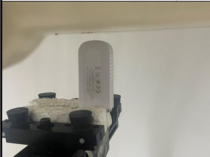
Tip Mode of EUT with 0.5 cm Gap