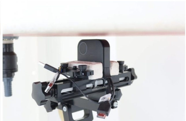
Left Side at 5 mm