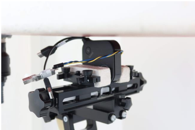
Right Side at 5 mm