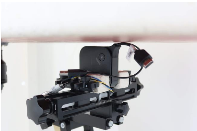
Top Side at 5 mm