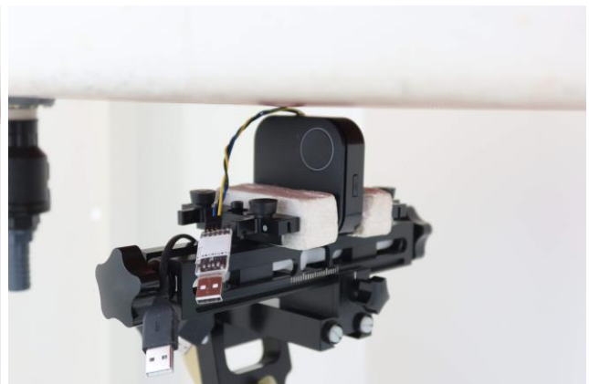
Bottom Side at 5 mm