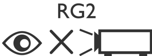
Figure 1: IEC 62471-5:2015