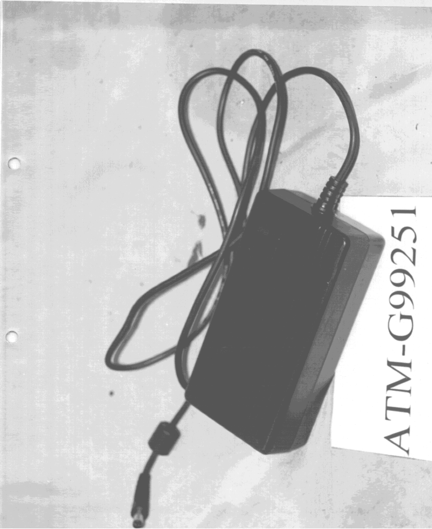
Figure 25 Power Adapter (Appearance, Front & Side View)