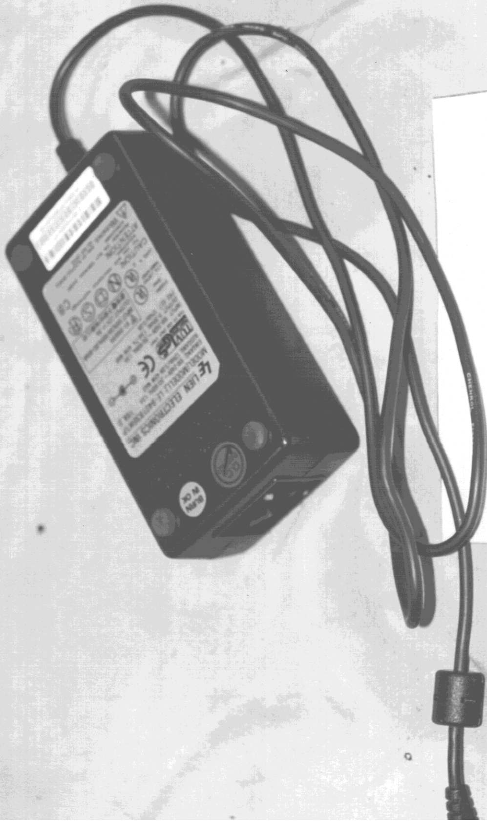
Figure 26 Power Adapter (Appearance, Back & Side View)