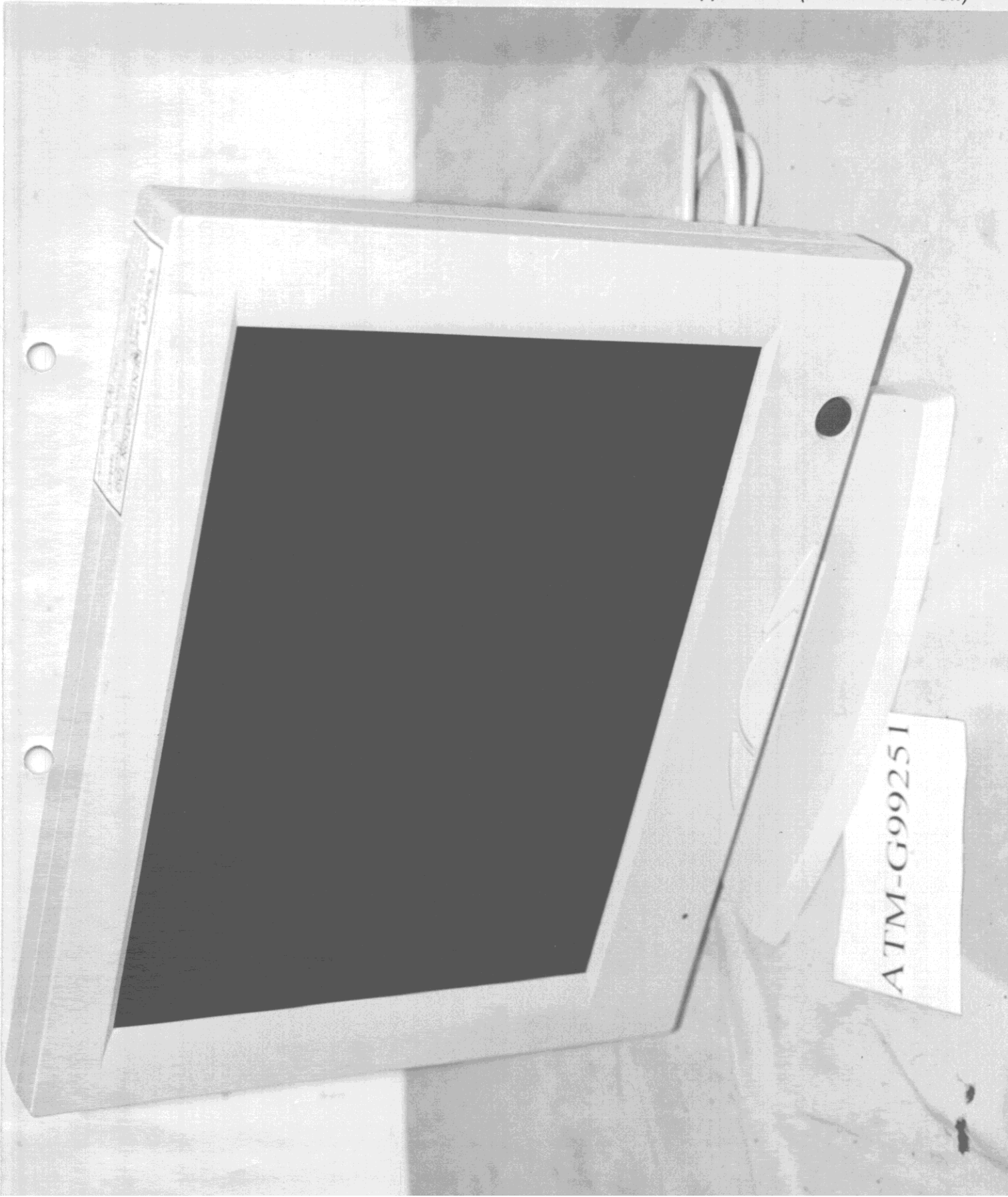
Figure 1 General Appearance (Front & Side View)