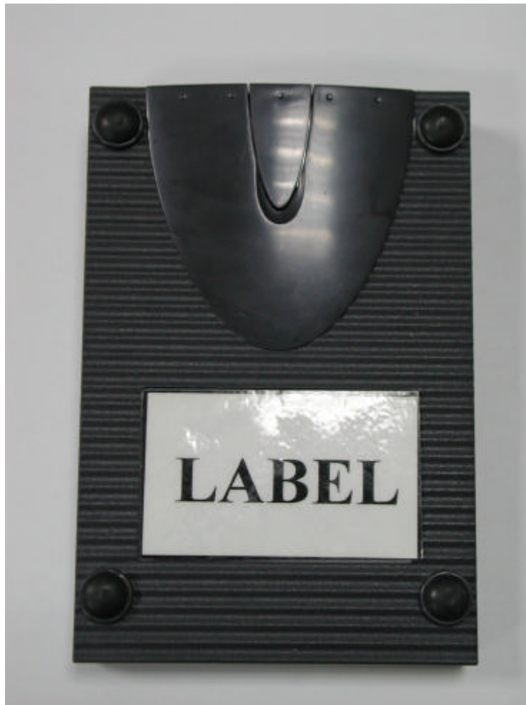
Label Location of BenQ AWL300R