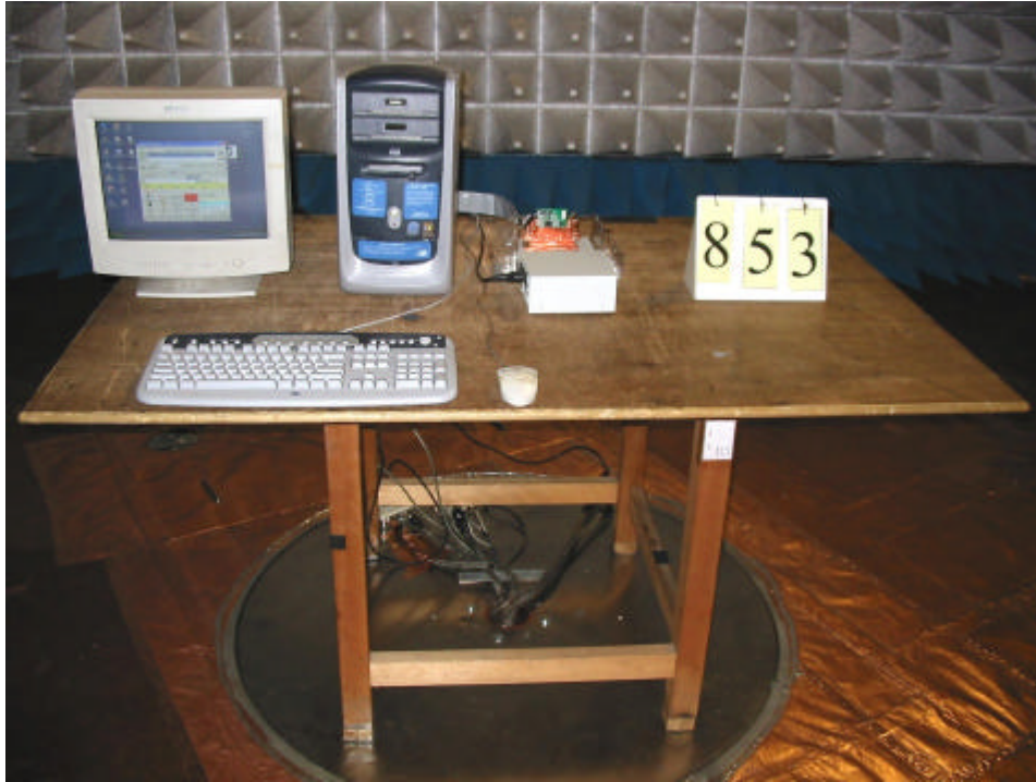
Front View of the Test Configuration of Intentional