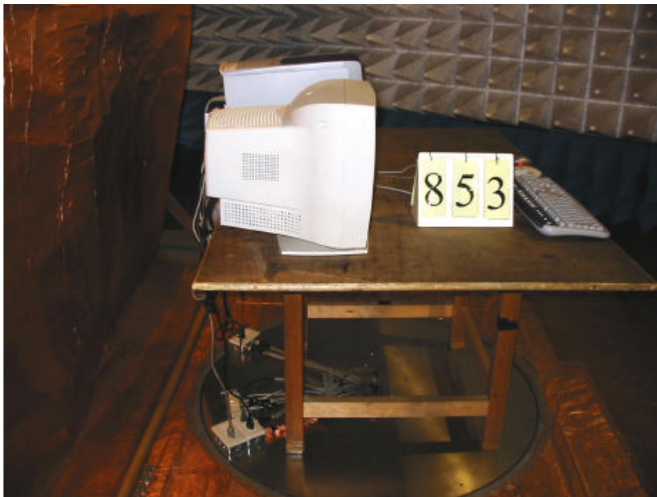
Side View of the Test Configuration