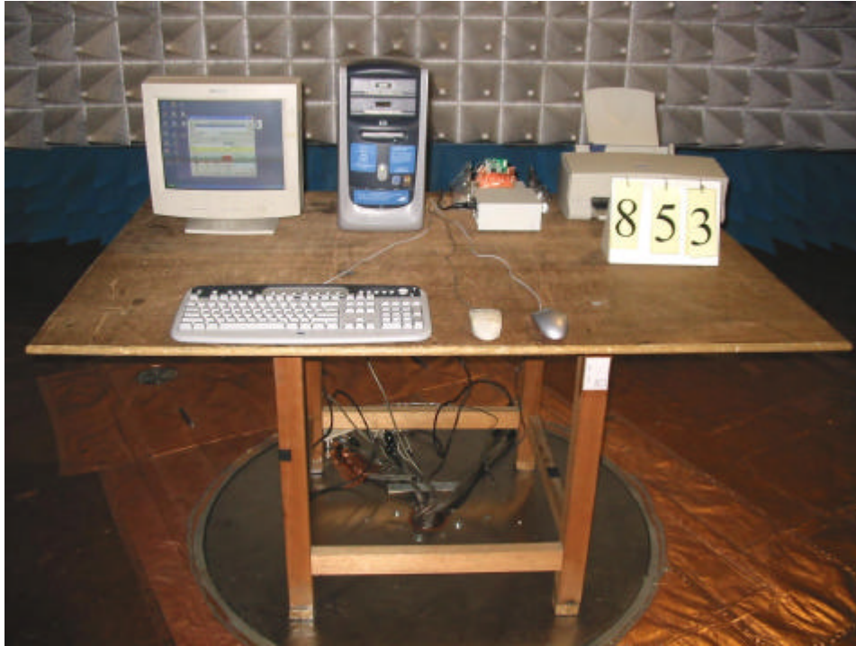
Front View of the Test Configuration of unintentional