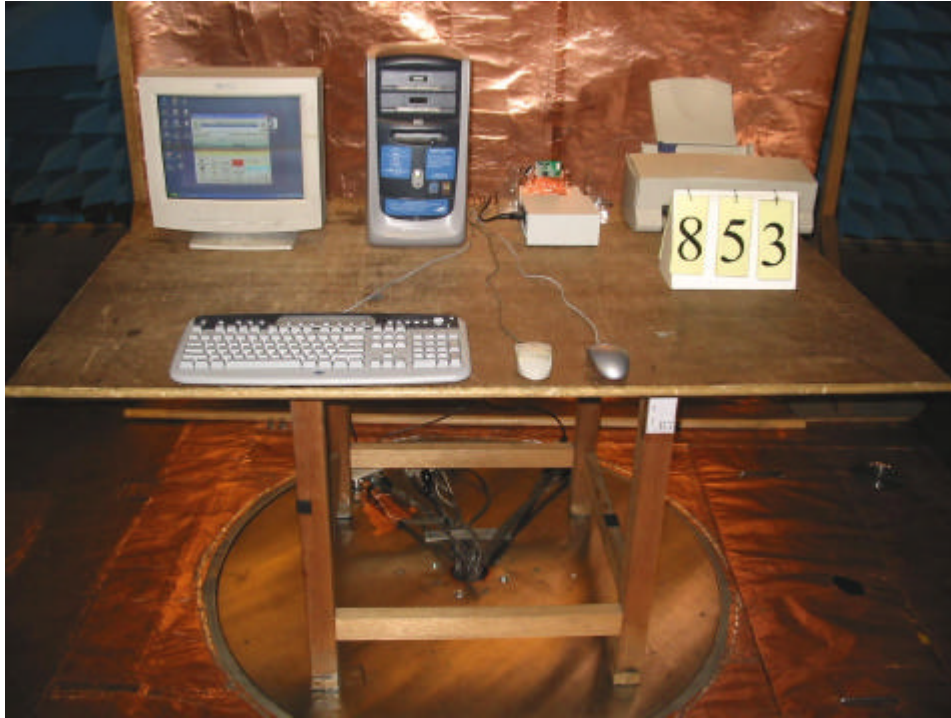
Front View of the Test Configuration