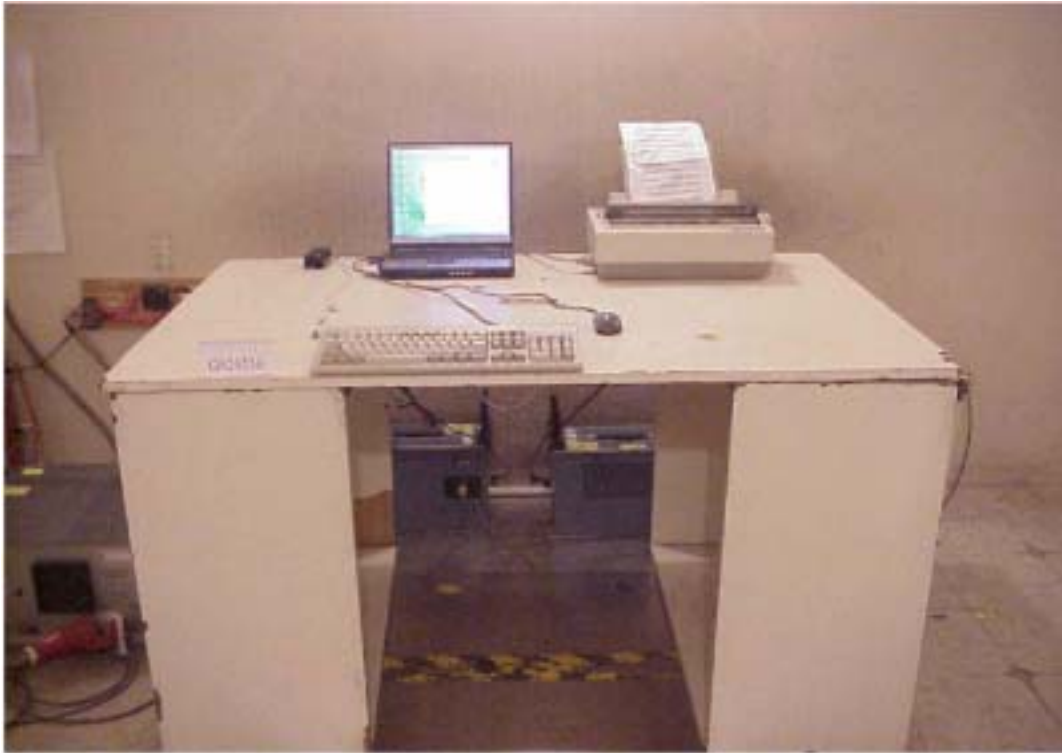
BACK VIEW OF CONDUCTED TEST