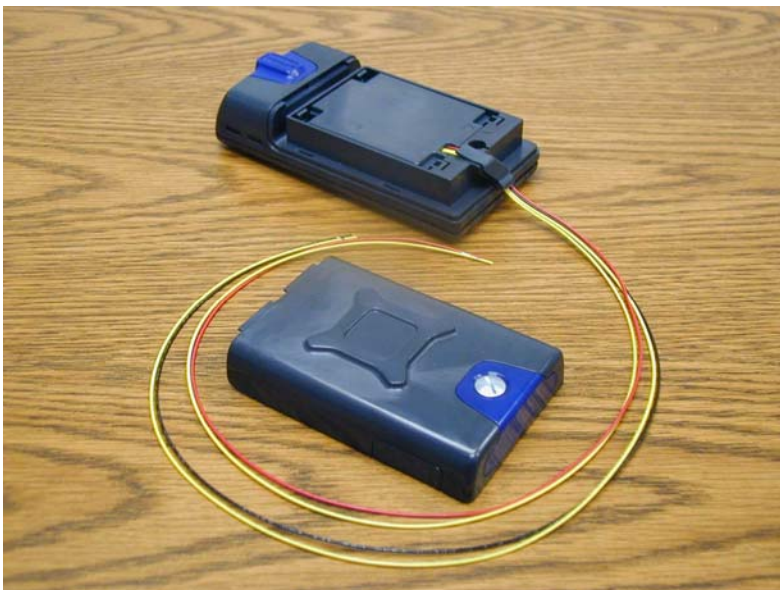
Revised VAM in revised base with cover removed.