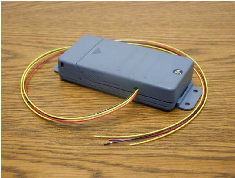
Original TrimTrac base with VAM module installed.