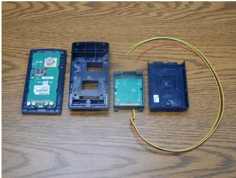
Revised VAM module with revised housing for base and cover.