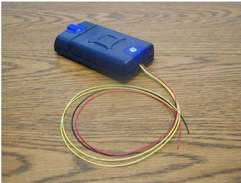
Revised TrimTrac base with VAM module installed and cover in place.