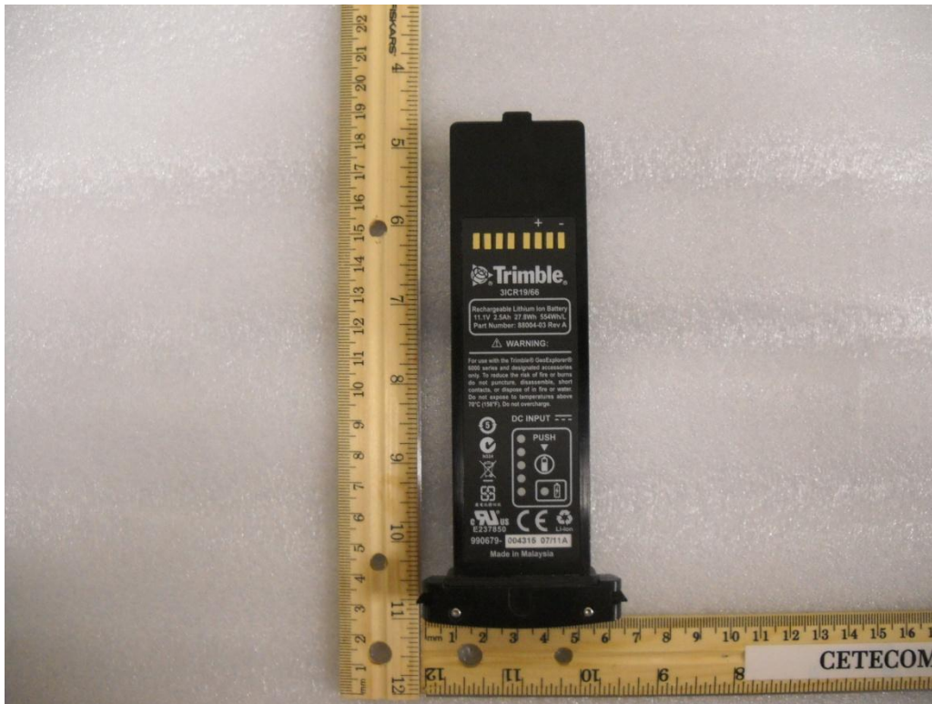
EUT Battery Bottom