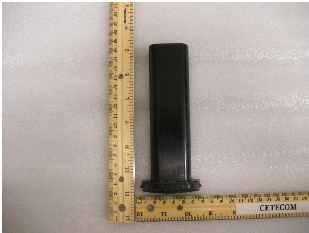
EUT Battery Front