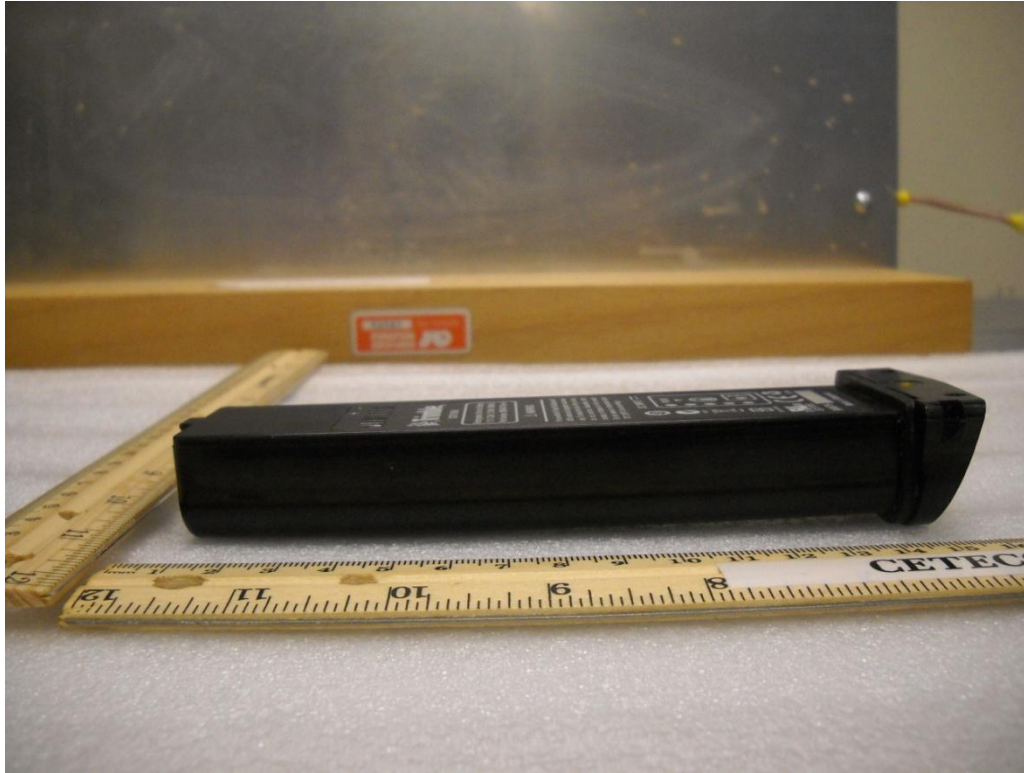
EUT Battery Side