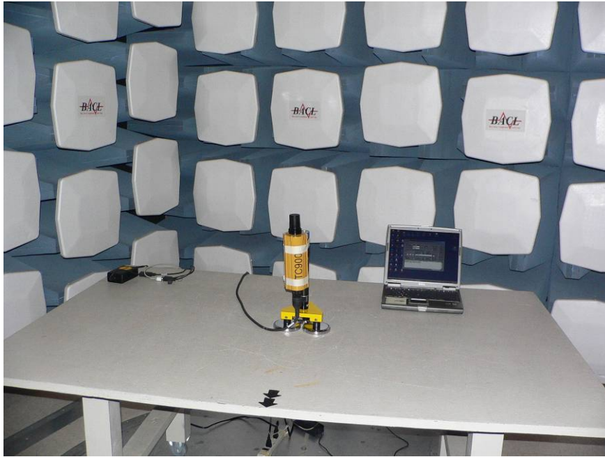
Radiated Emissions - Rear View with Omni antenna