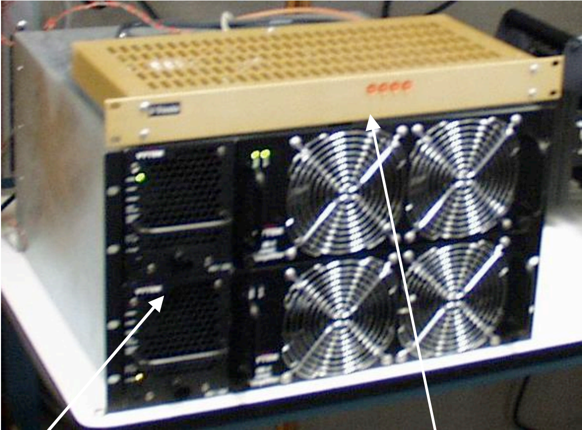
RF power amplifier section