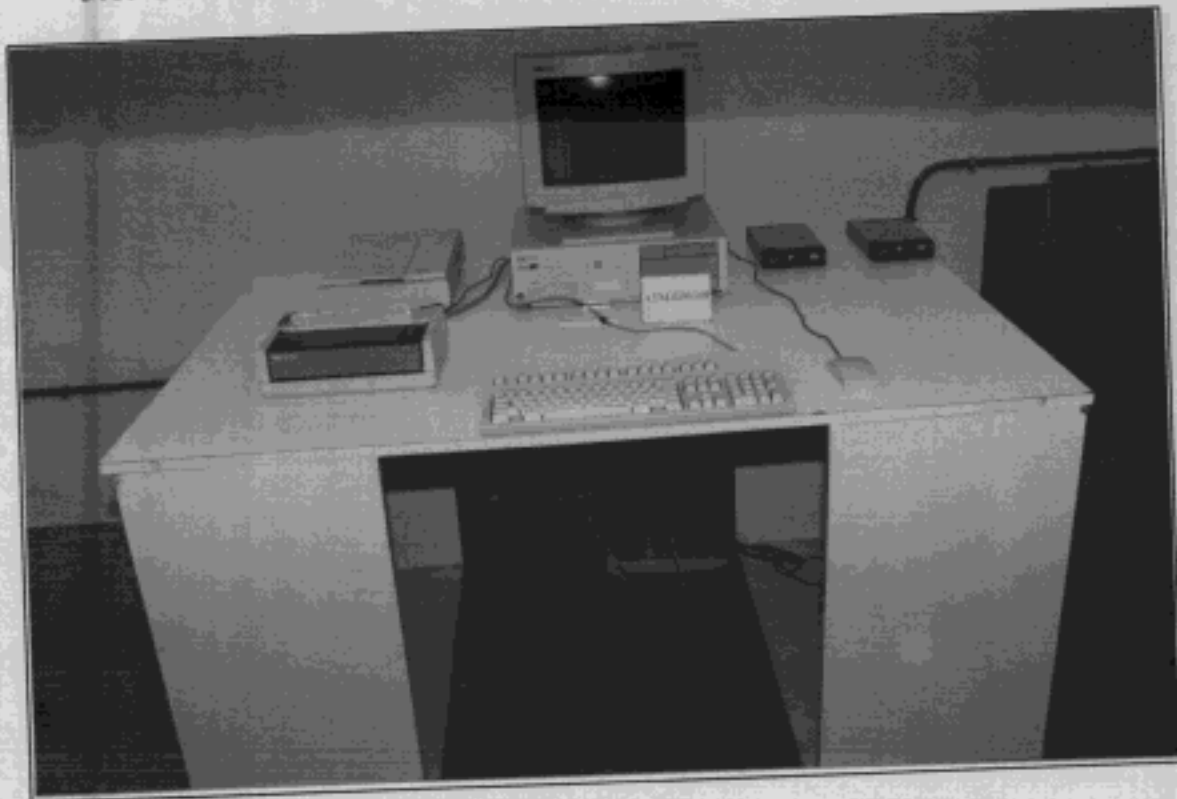
FRONT VIEW OF CONDUCTED TEST