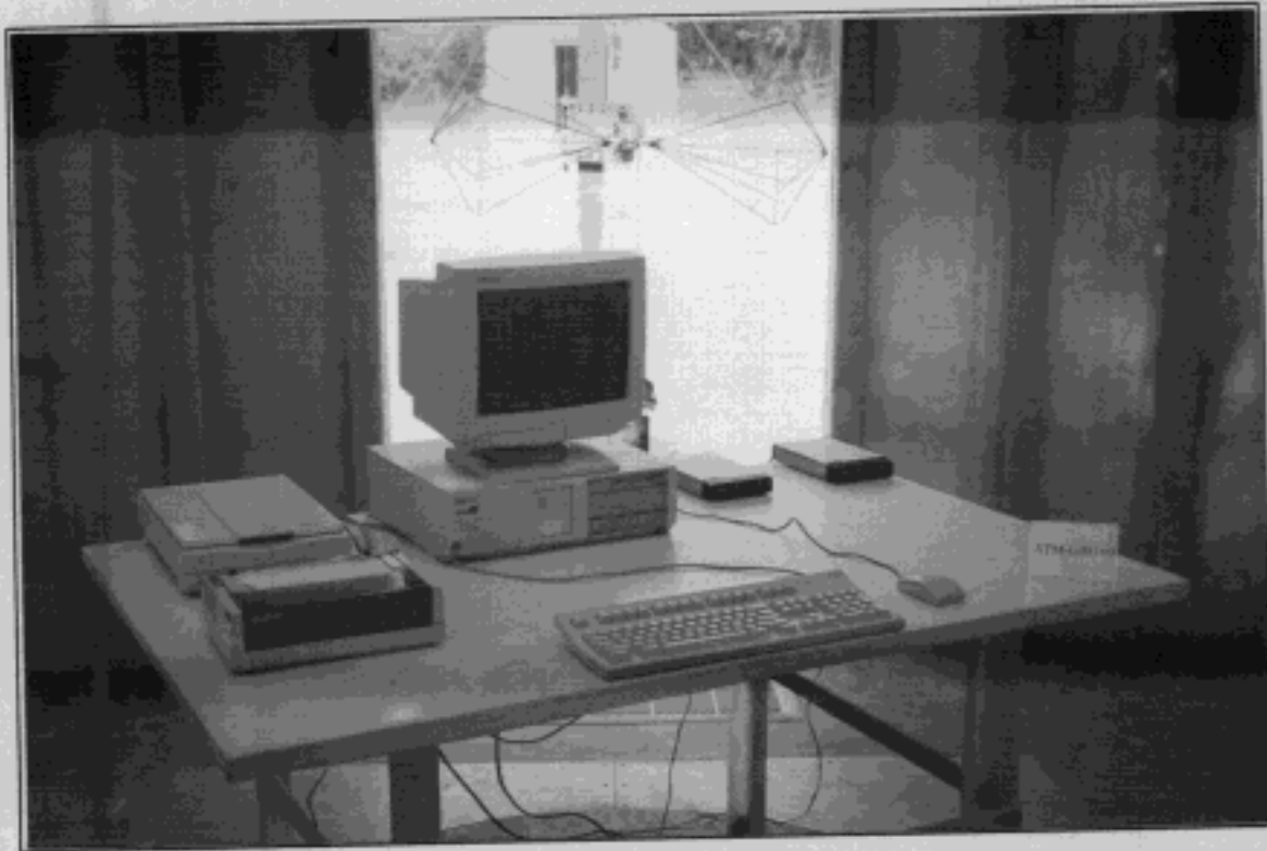
SETUP WITH MAXIMUM DETECTED EMISSION AT HORIZONTAL POLARIZATION