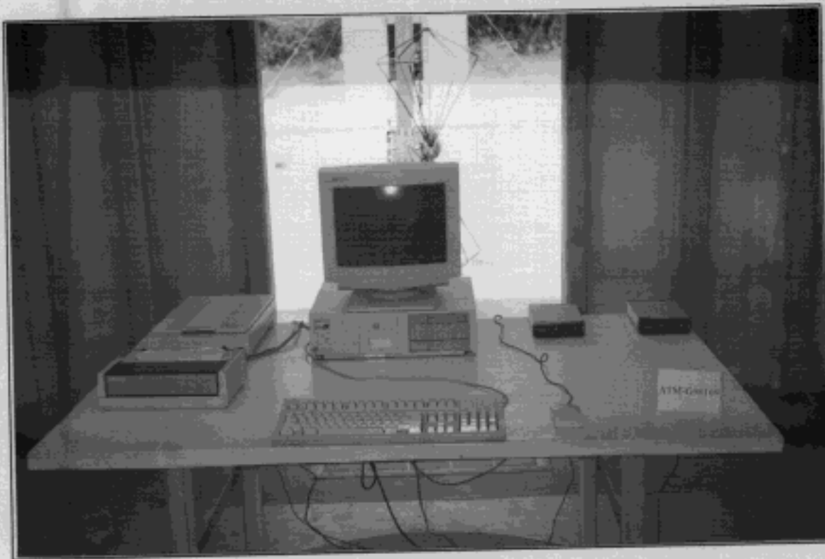
FRONT VIEW OF RADIATED TEST