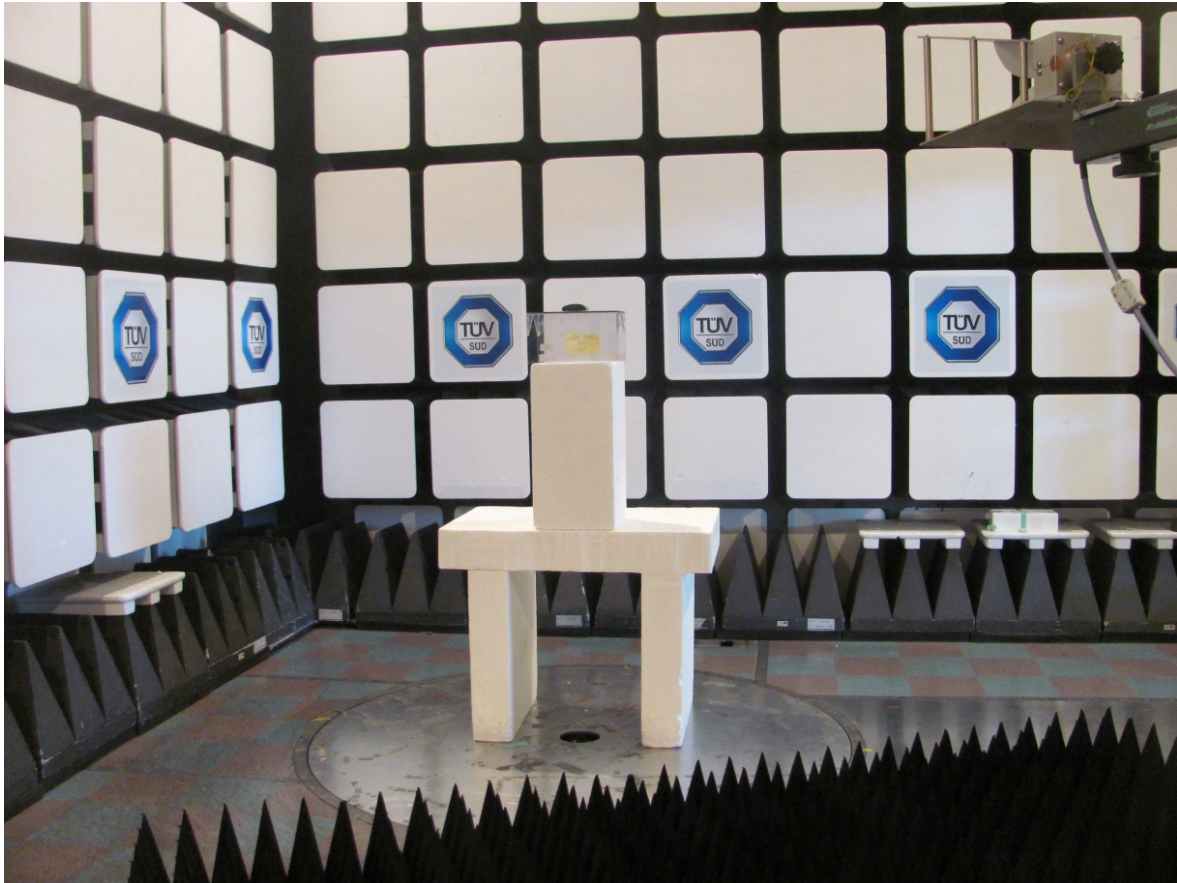
Figure 2 – Radiated Emissions Setup – Photo 2