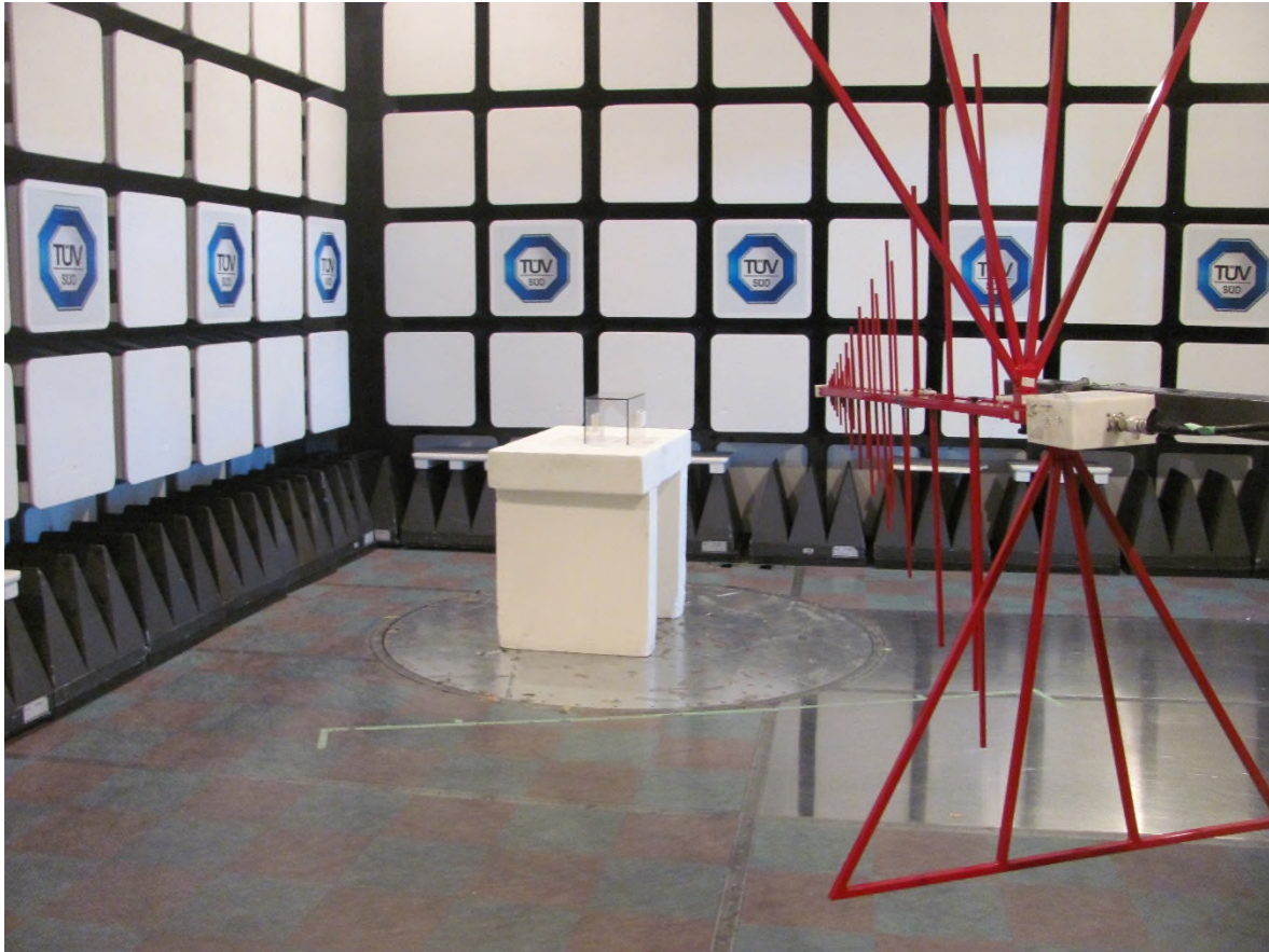
Figure 1 – Radiated Emissions Setup – Photo 1