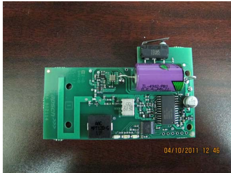
PCA Front Photo