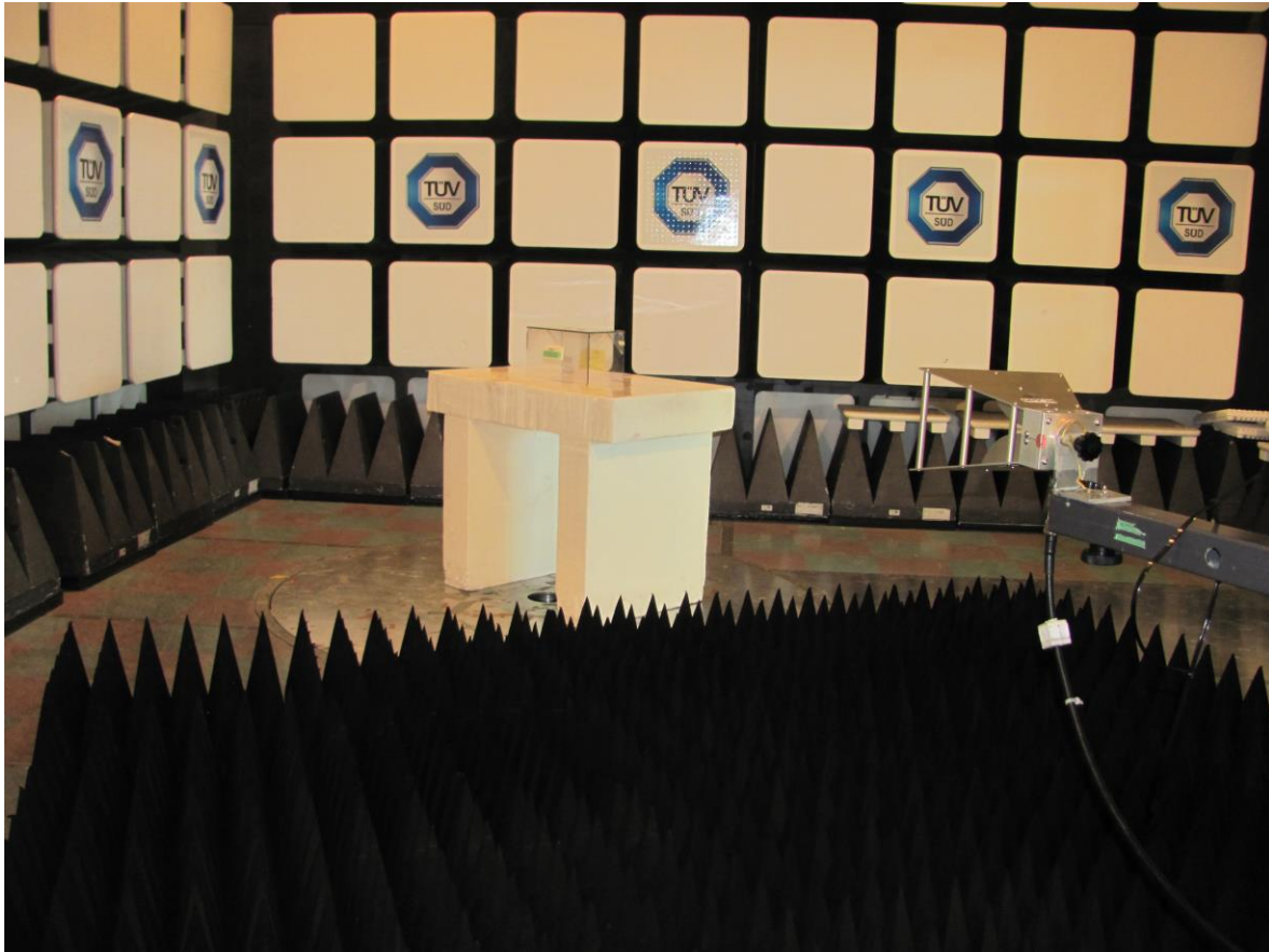
Figure 2 – Radiated Emissions Setup – Photo 2