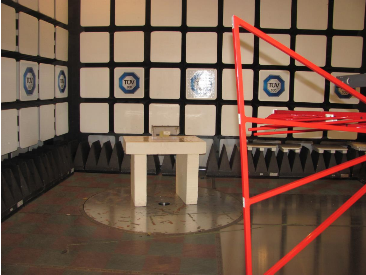
Figure 1 – Radiated Emissions Setup – Photo 1