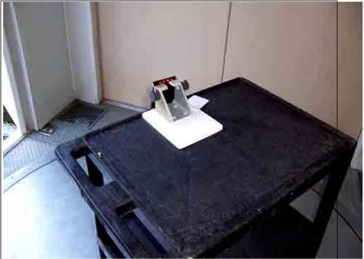
Radiated Emissions - Front View - 6111B