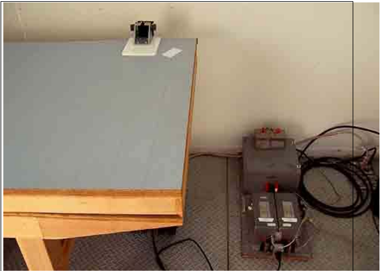
Mains Conducted Emissions - Front View - 6111B