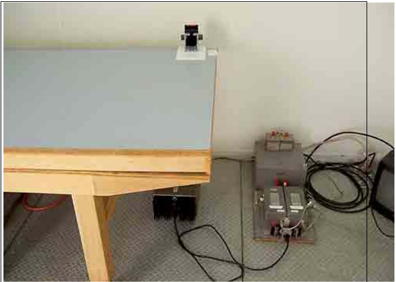
Mains Conducted Emissions - Front View - 6121B