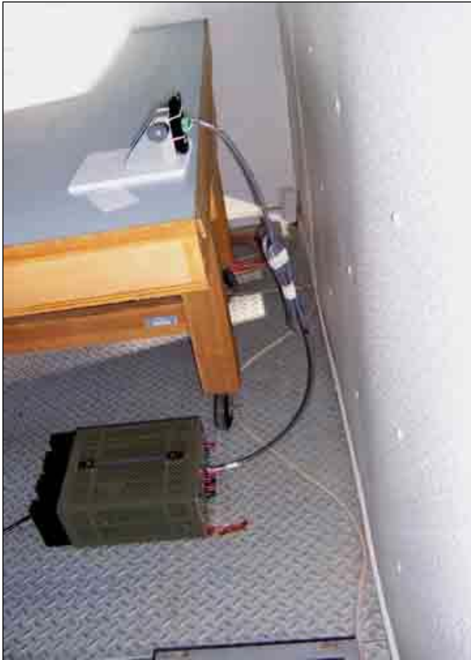
Mains Conducted Emissions - Side View - 6101B