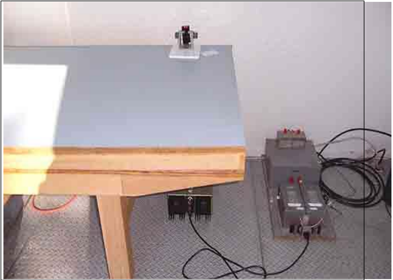
Mains Conducted Emissions - Front View - 6101B