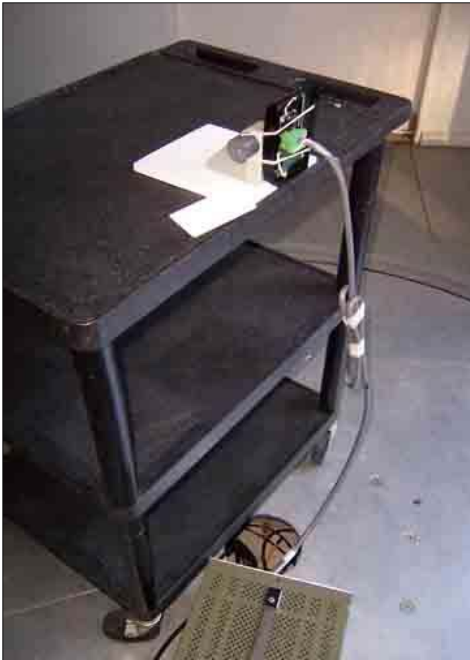
Radiated Emissions - Back View - 6121B