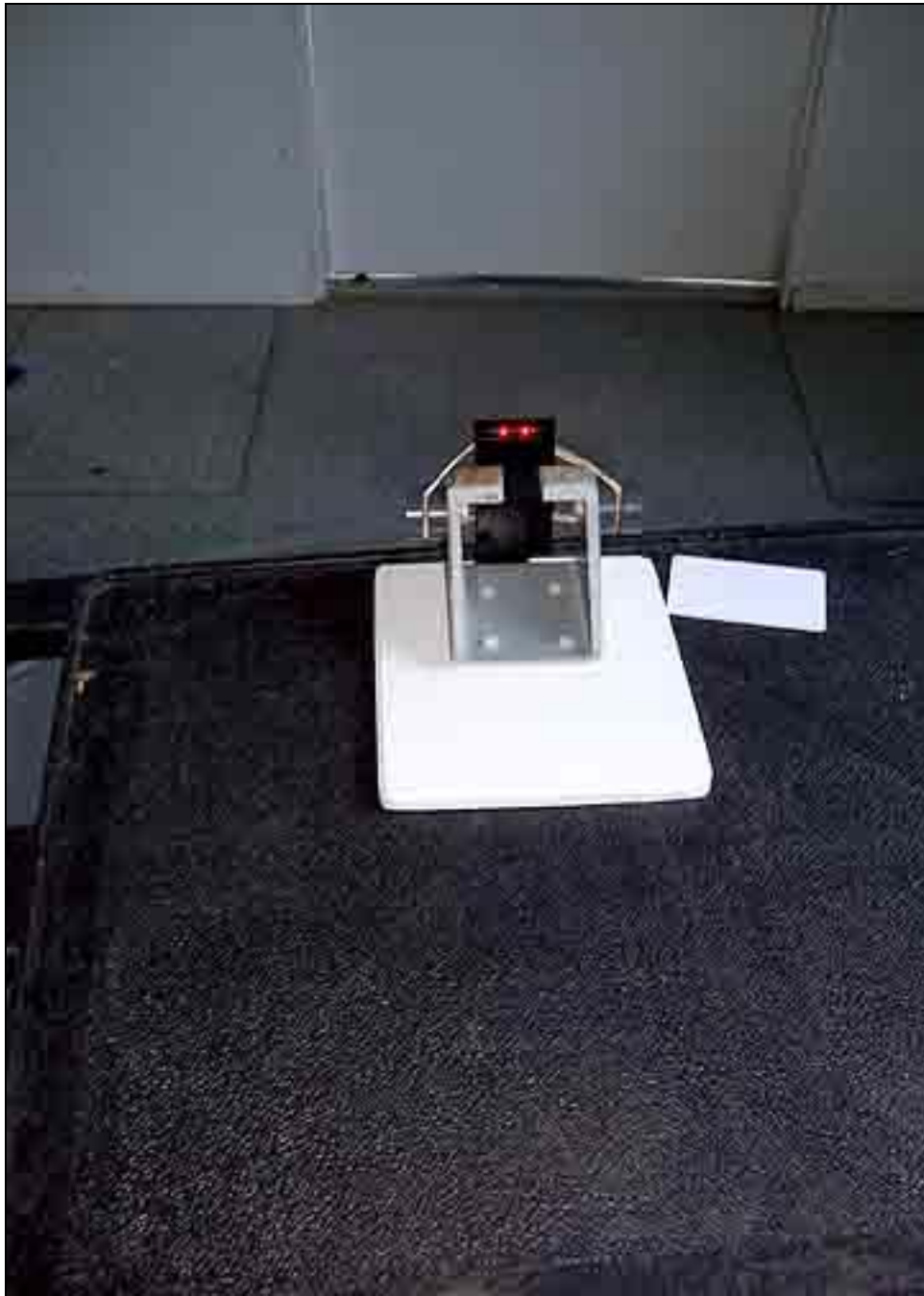
Radiated Emissions - Front View - 6101B