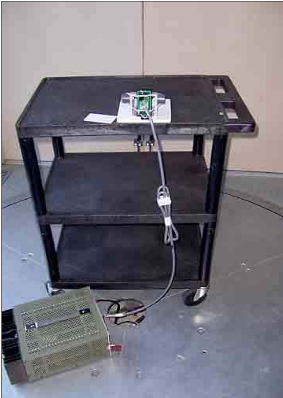
Radiated Emissions - Back View - 6101B