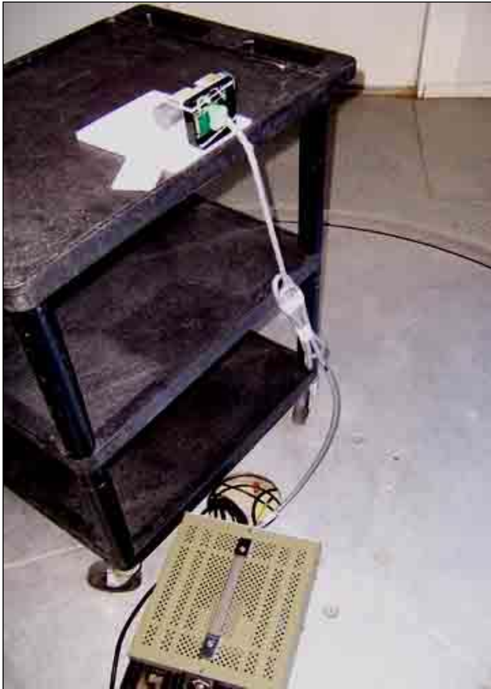
Radiated Emissions - Back View - 6111B