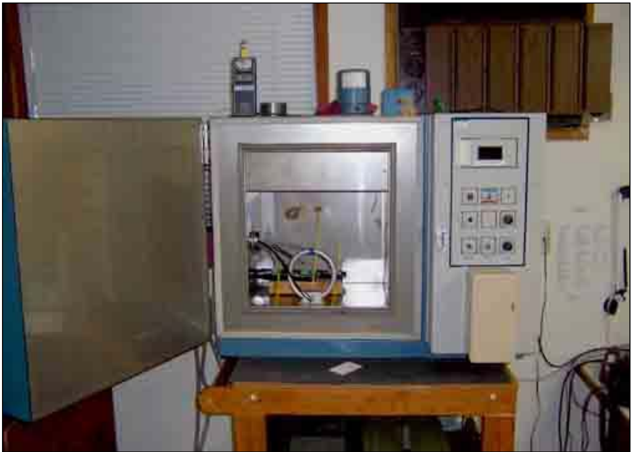
PHOTOGRAPH SHOWING TEMPERATURE TESTING