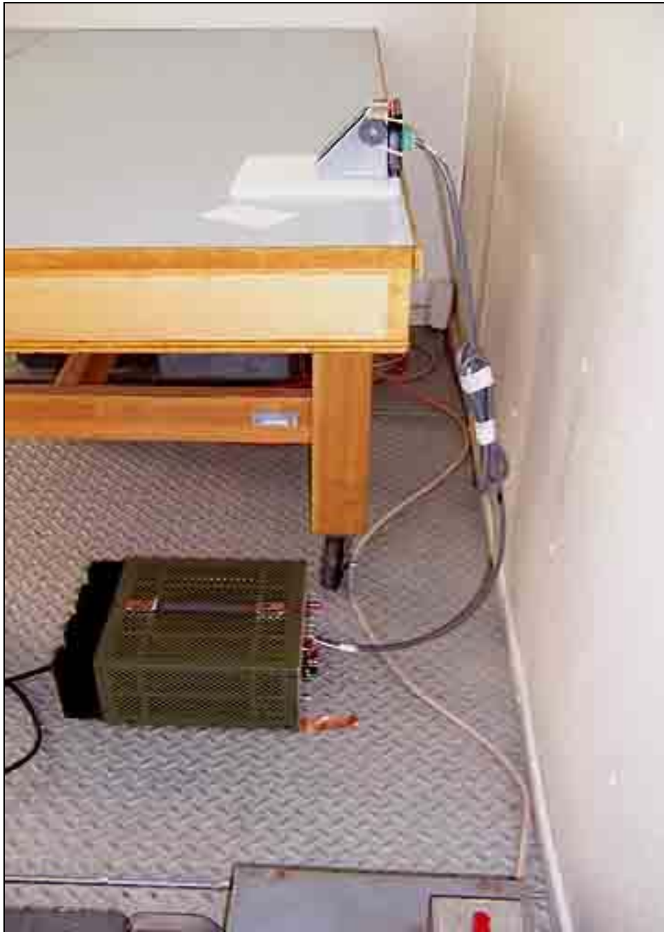
Mains Conducted Emissions - Side View - 6111B