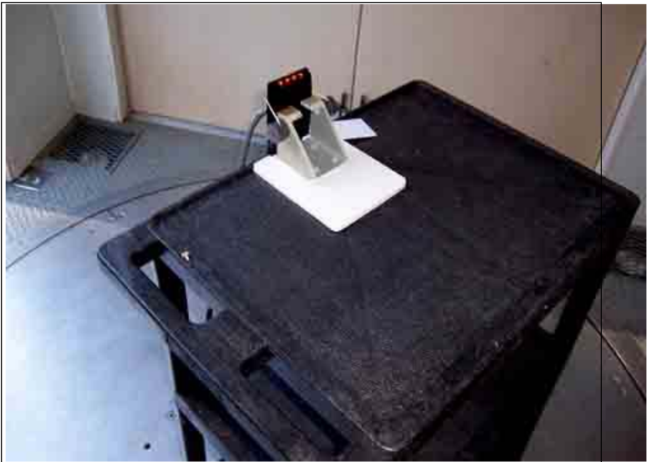
Radiated Emissions - Front View - 6121B