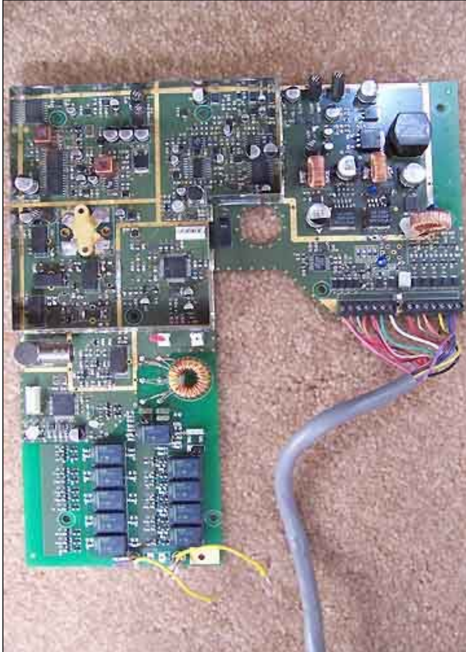
PCB Top - RF Shield Removed