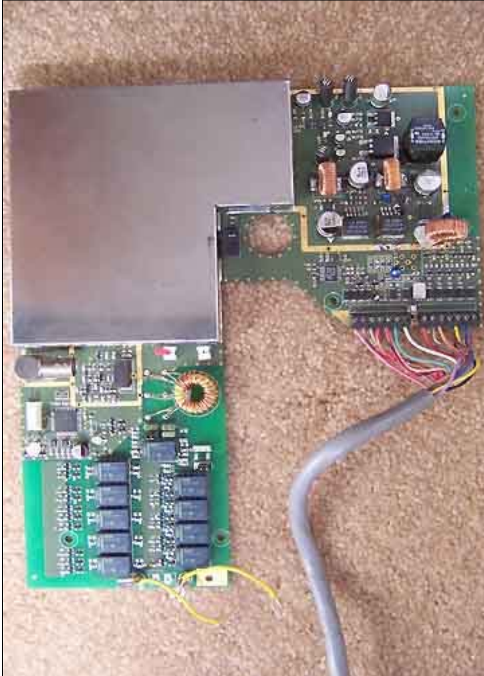
PCB Top - RF Shield Installed