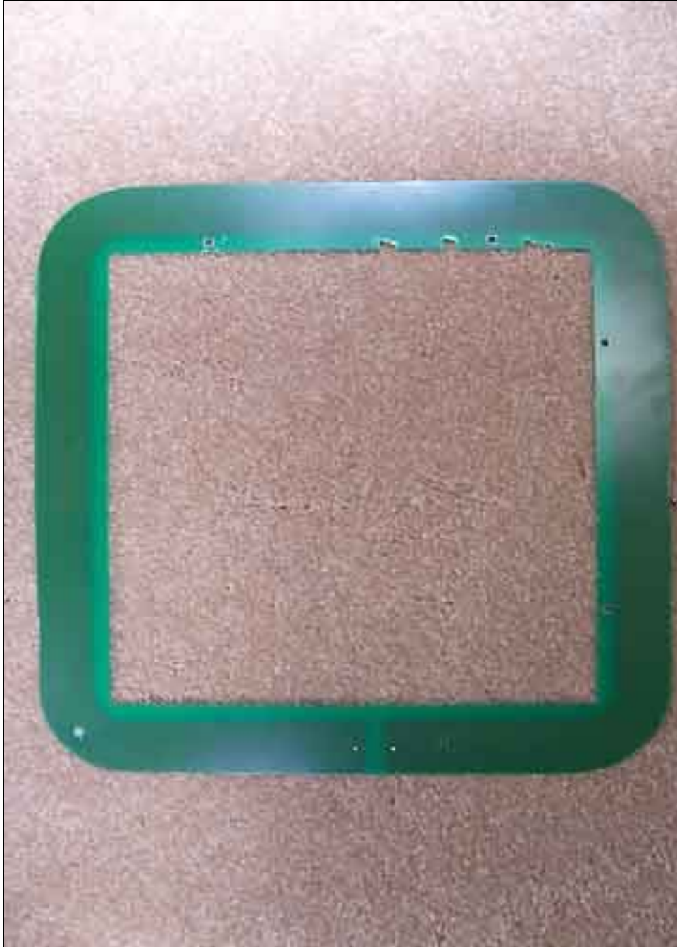
Antenna PCB Back