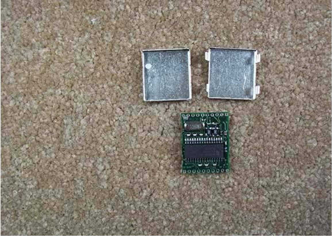
RF Can PCB Top