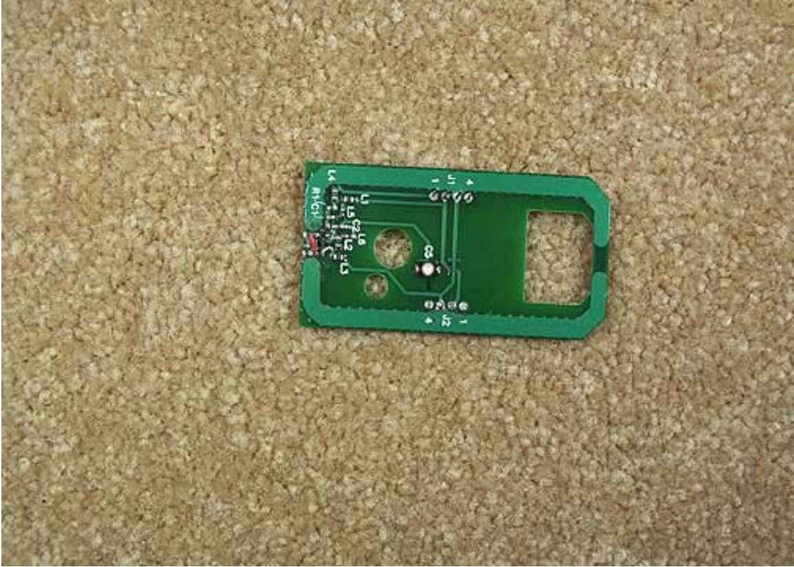
Antenna PCB Top