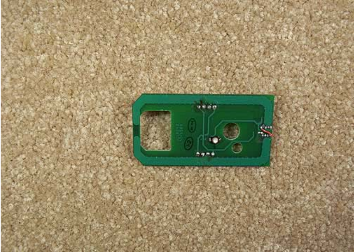
Antenna PCB Bottom