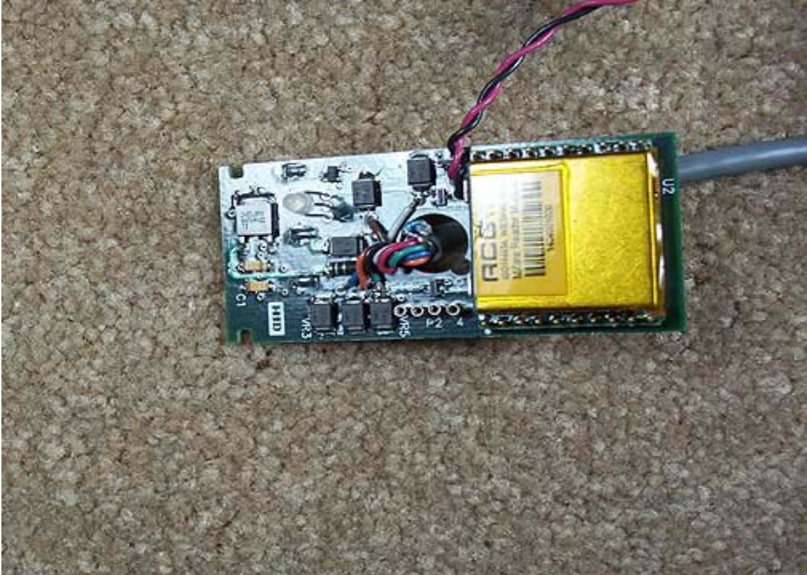
Main PCB Front