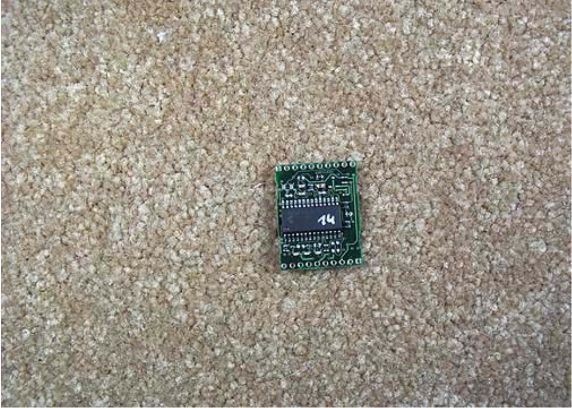
RF Can PCB Bottom