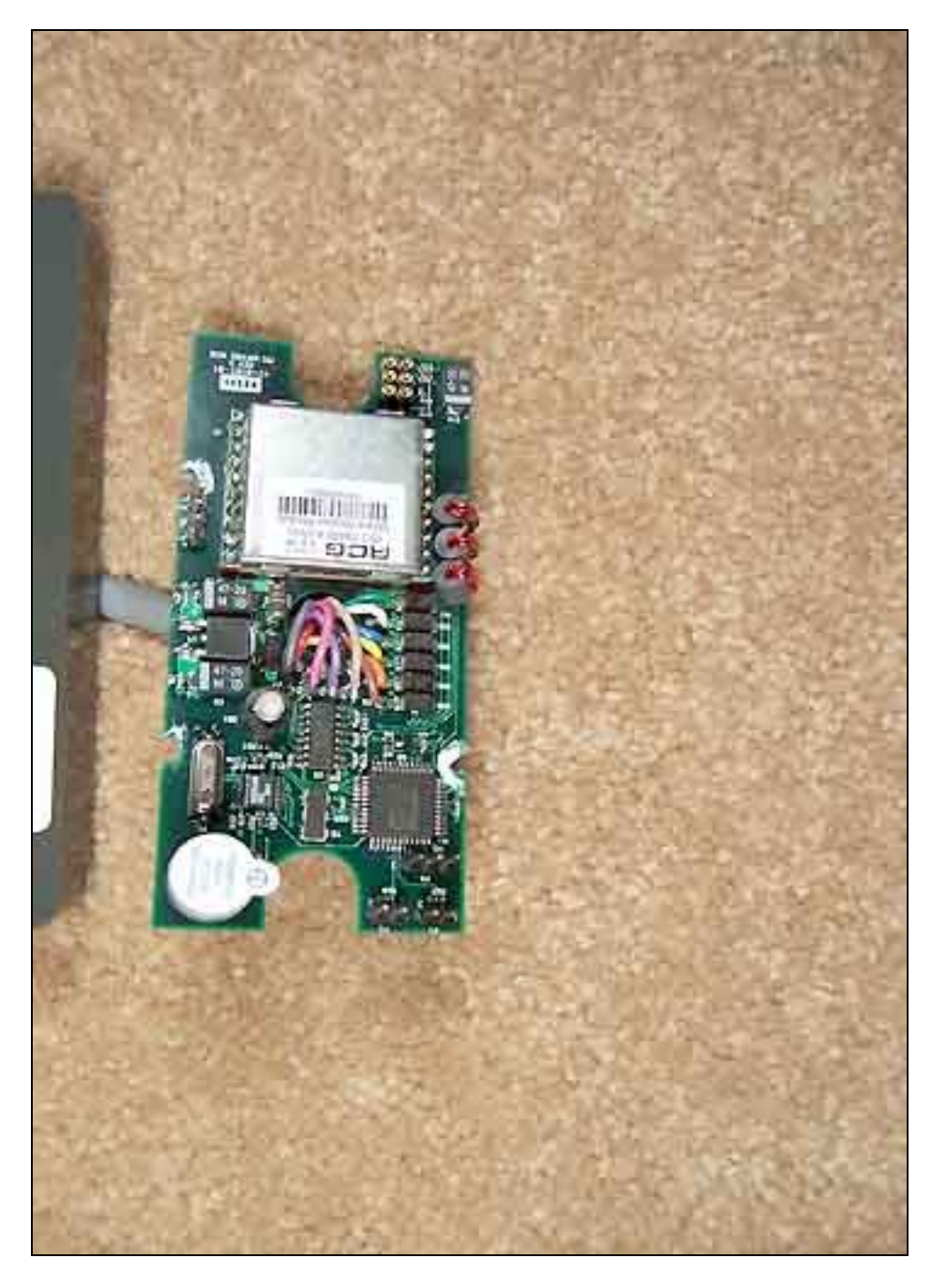
Main PCB Unpotted Top