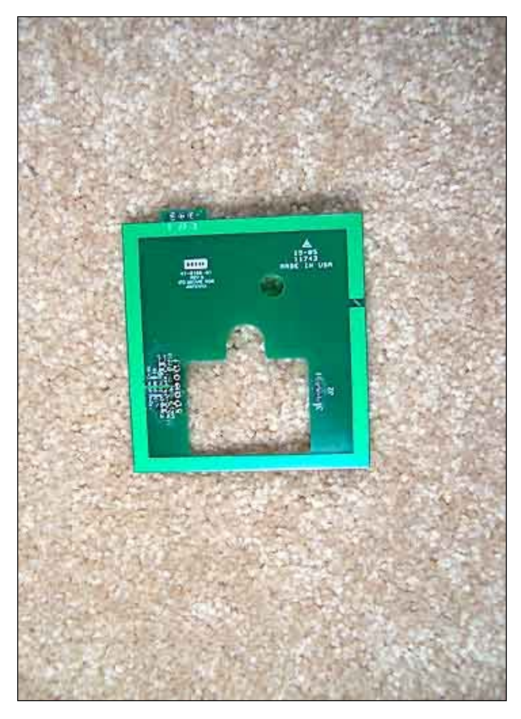
Antenna PCB Top