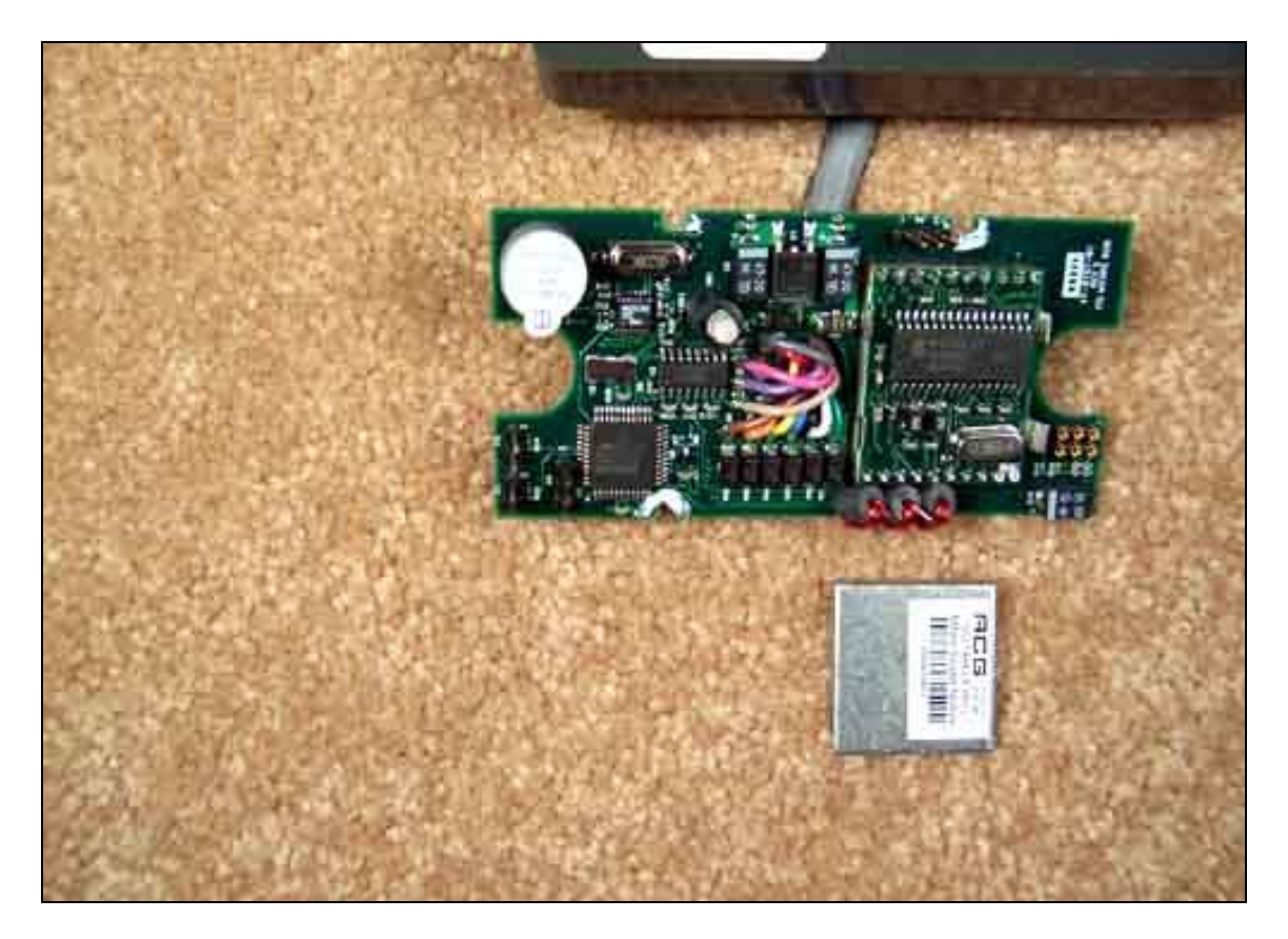
Main PCB Unpotted Top – Shield Removed