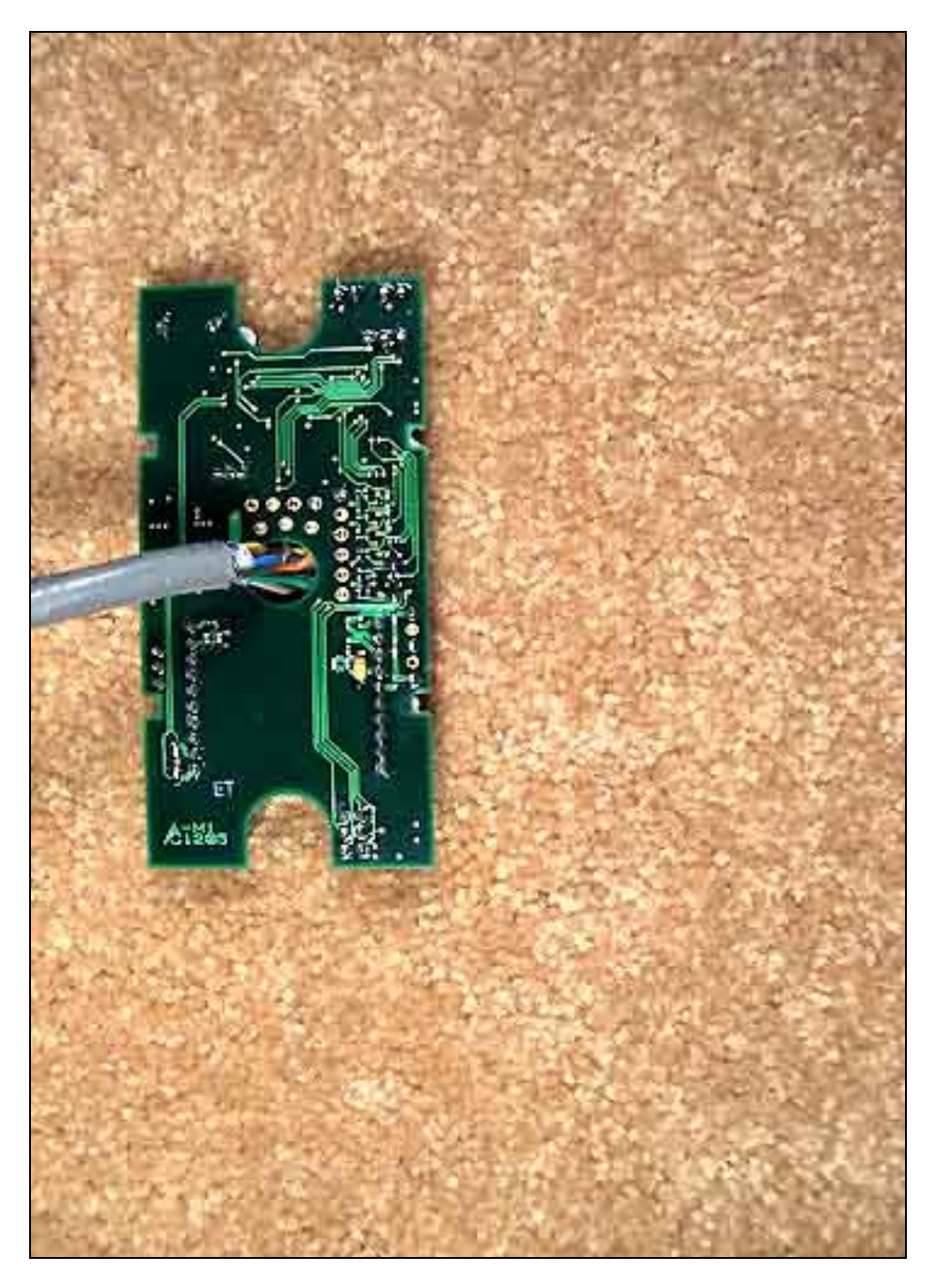
Main PCB Unpotted Bottom