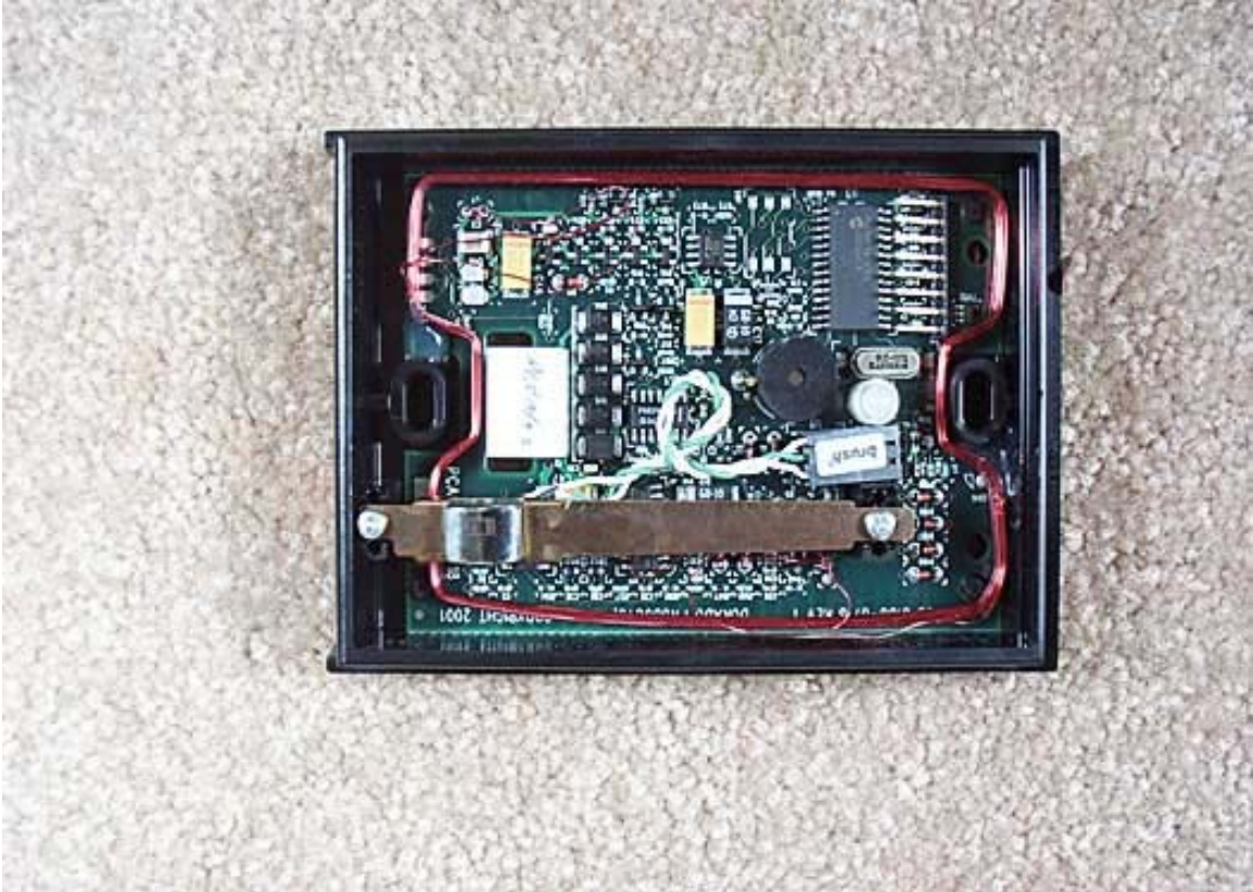
PCB with Antennas