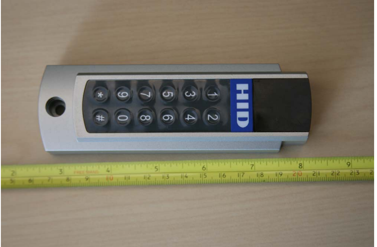
Top – with optional Keypad