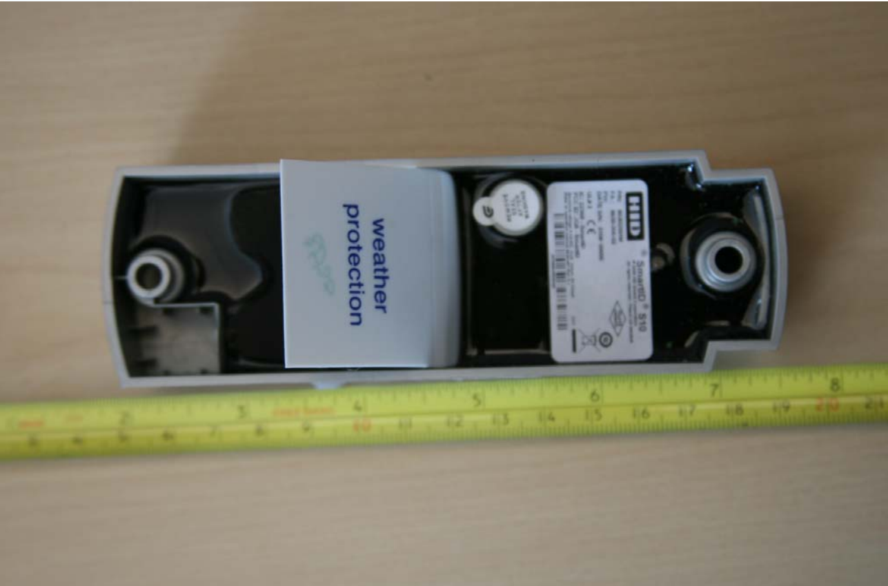
Back showing label placement – Label is placed directly on the potting as shown above.