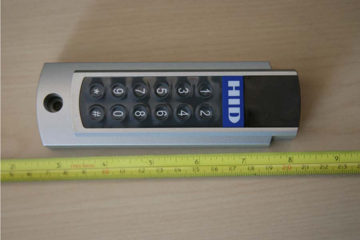
Top – with optional Keypad

8031D Shown – Identical to the 8101D – The only difference from the 8030D and 8100D = no keypad on front of unit