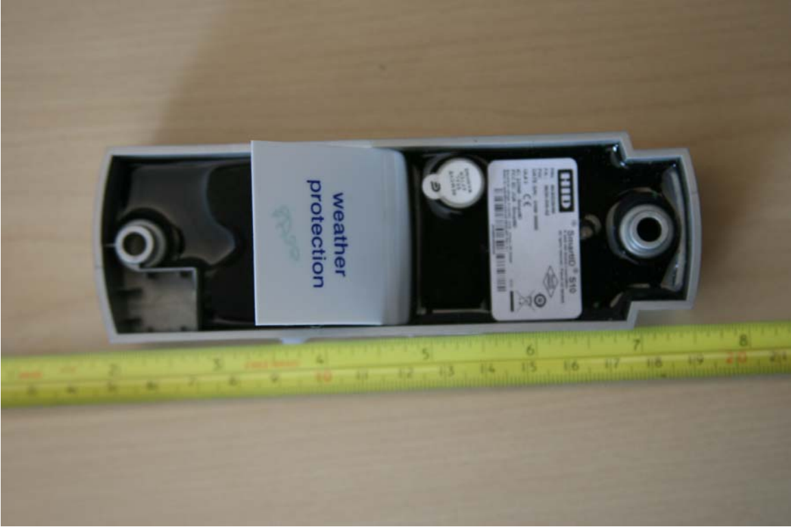
Back showing label placement – Label is placed directly on the potting as shown above.