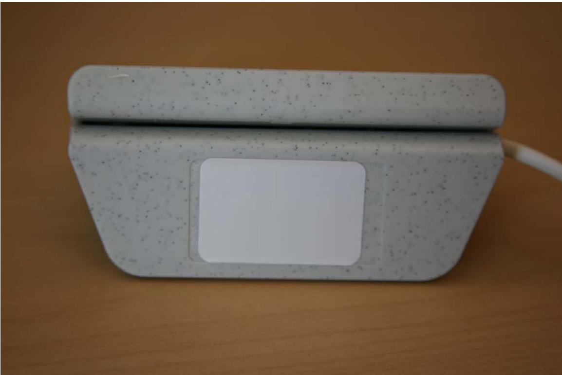
Bottom – showing Label placement